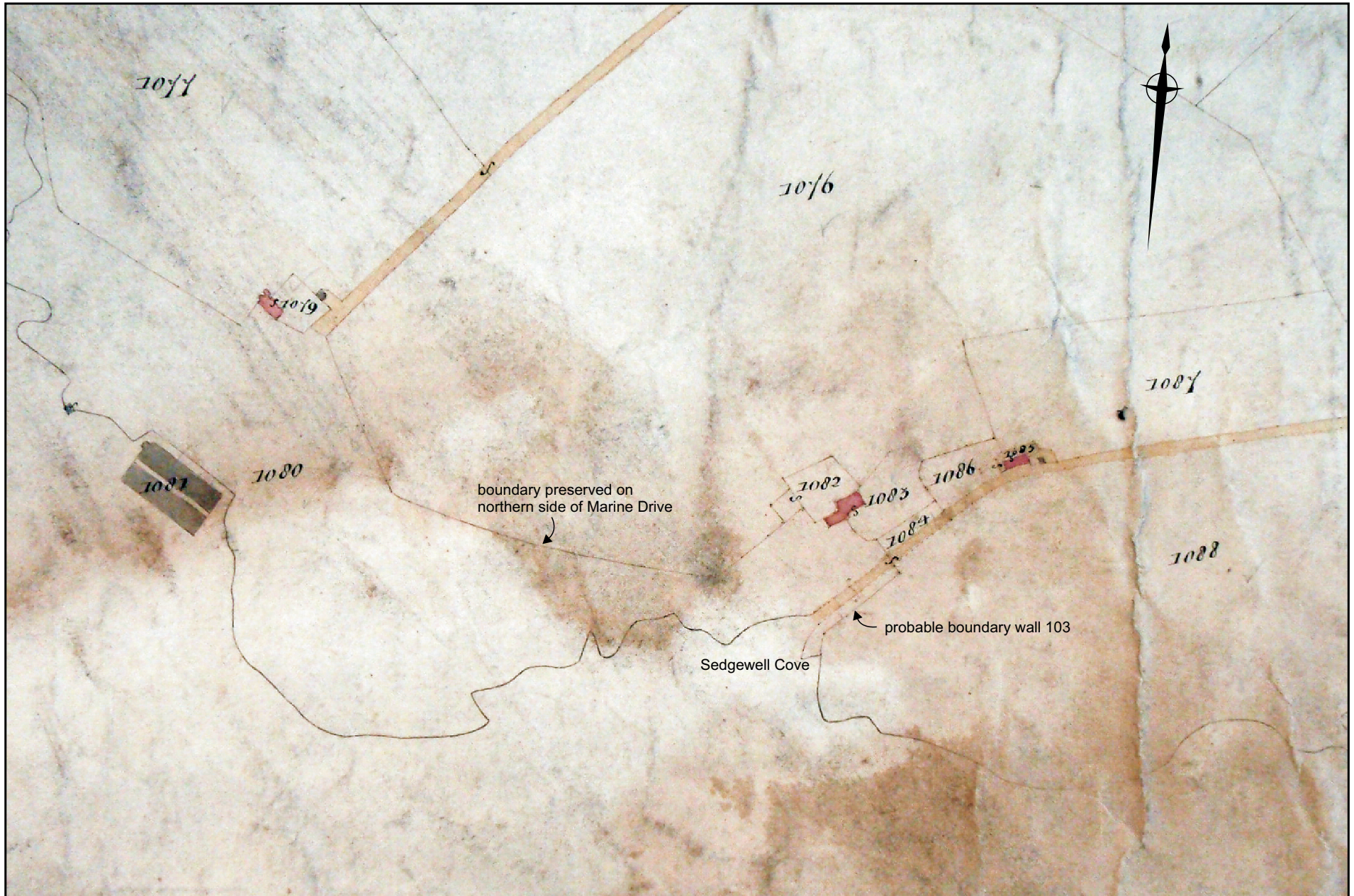
Fig. 2 Extract from the Bigbury-on-Sea tithe map of 1843. Scale 1:2500.