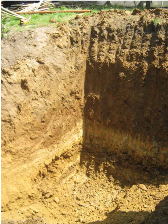
Pit for sewage pumping station