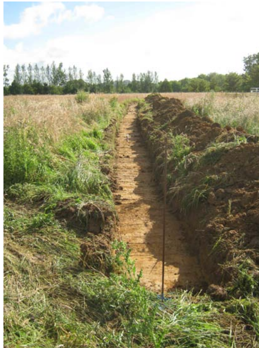
Fig. 3.1: Excavated trench facing north-east