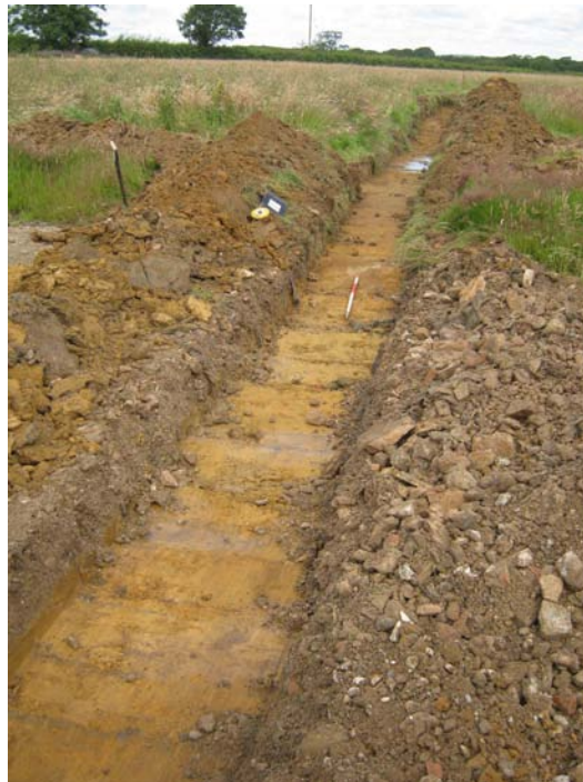
Fig. 3.2: Excavated trench facing west