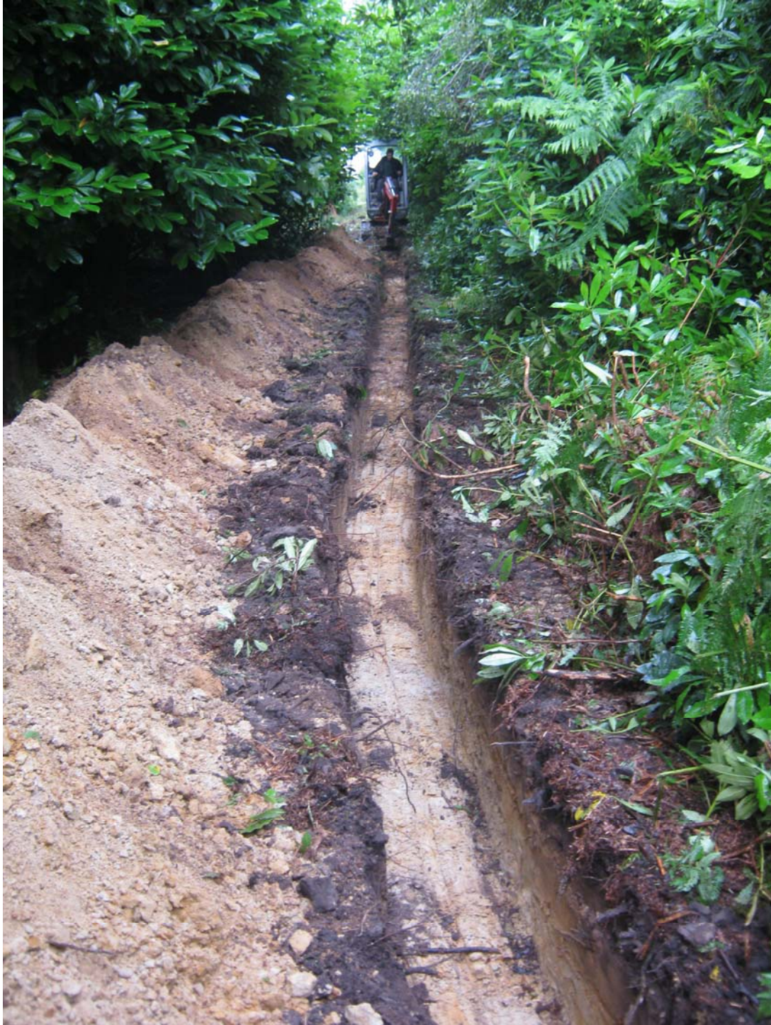
Eastern end of cable trench