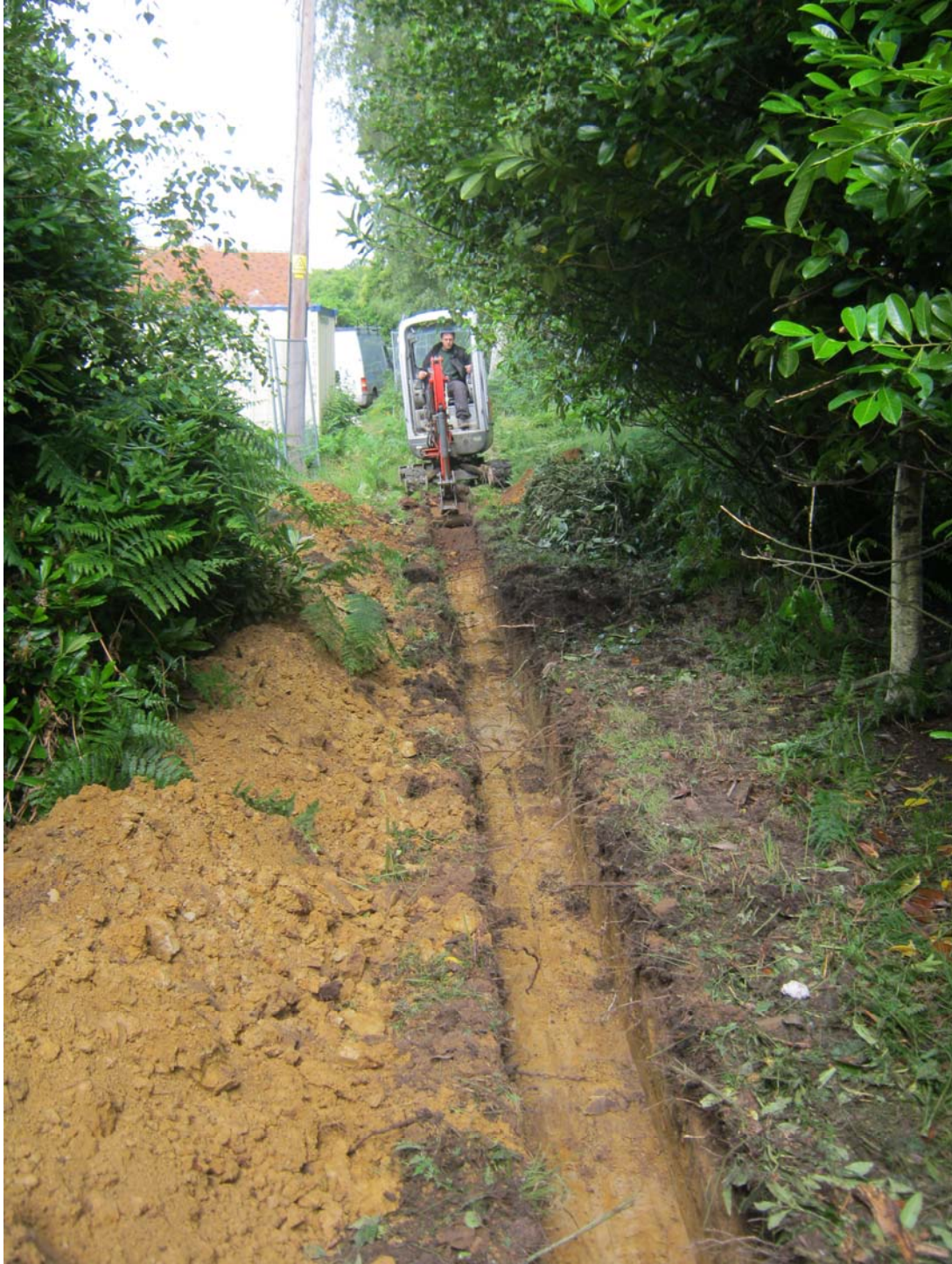
Middle of the cable route just before the swimming pool