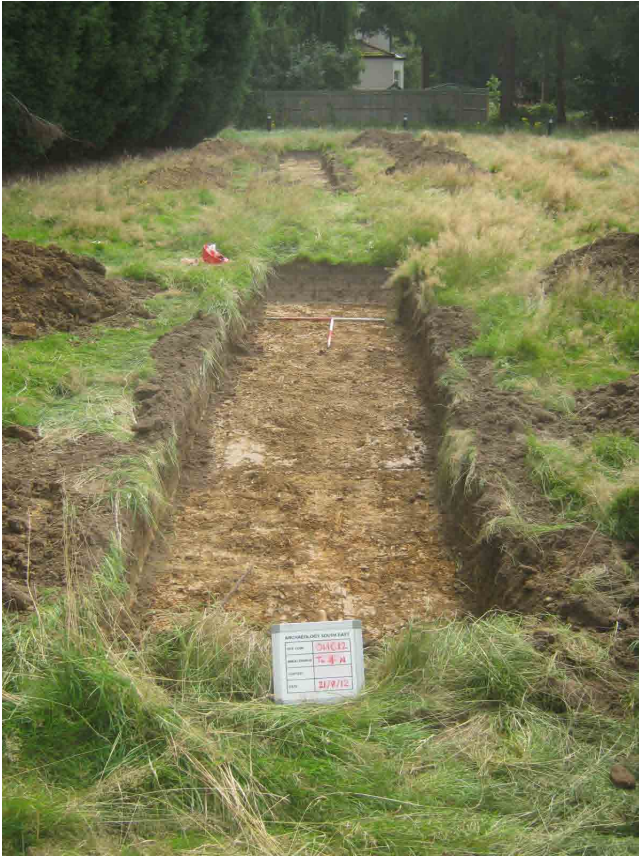
Fig. 4.1: Trench 4 north looking north-west