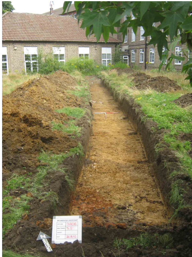
Fig. 4.3: Trench 5 looking north