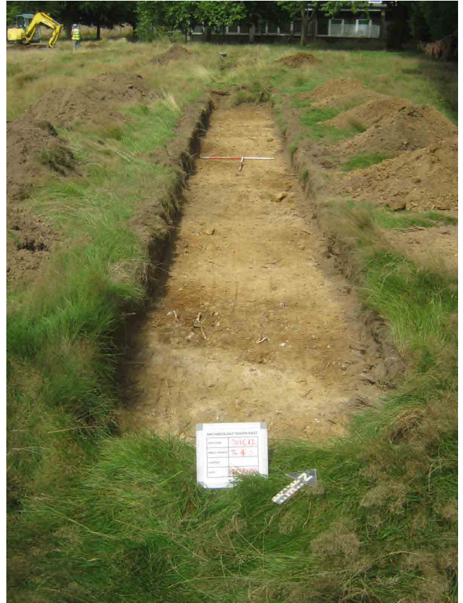
Fig. 4.2: Trench 4 south looking north-west