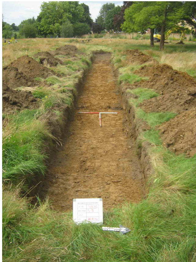
Fig. 3.3: Trench 3 looking west