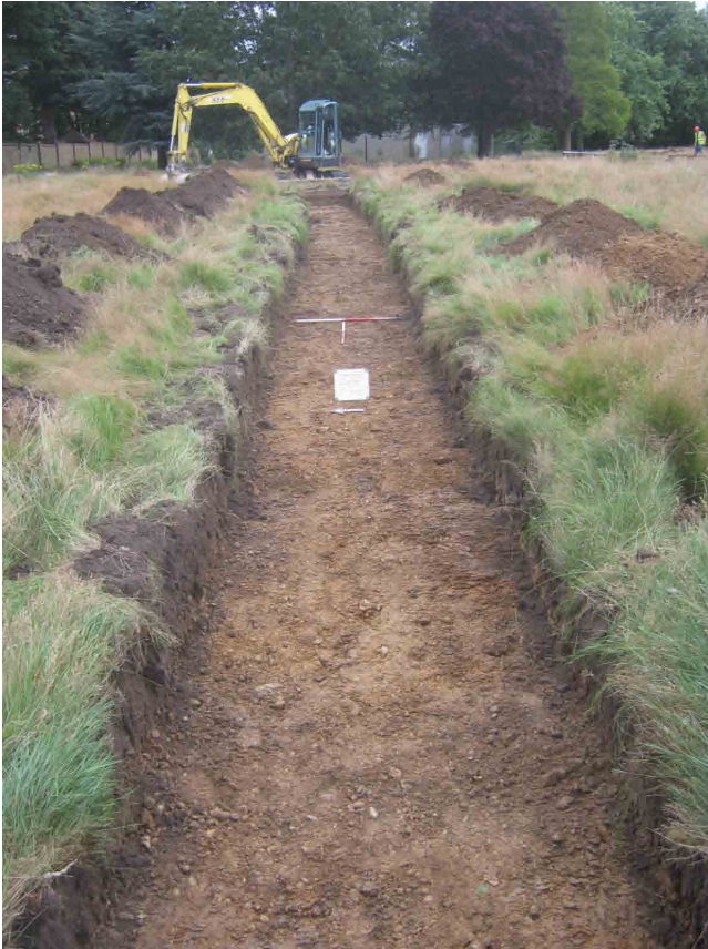
Fig. 3.1: Trench 1 looking east