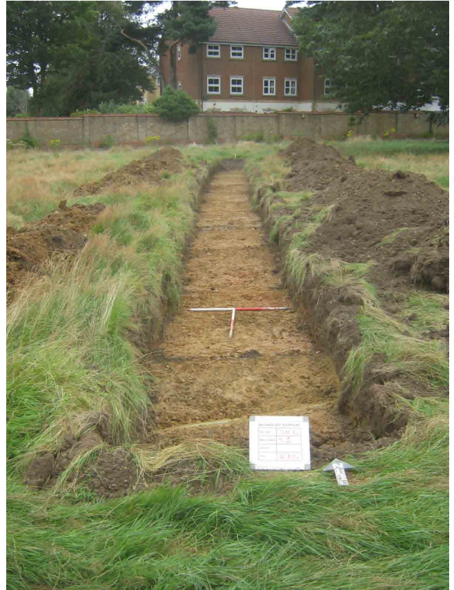
Fig. 3.2: Trench 2 looking north