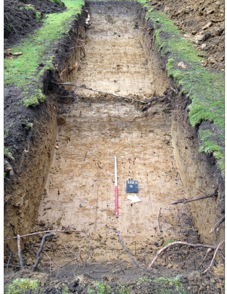
Figure 3: Excavated trench, looking southwest