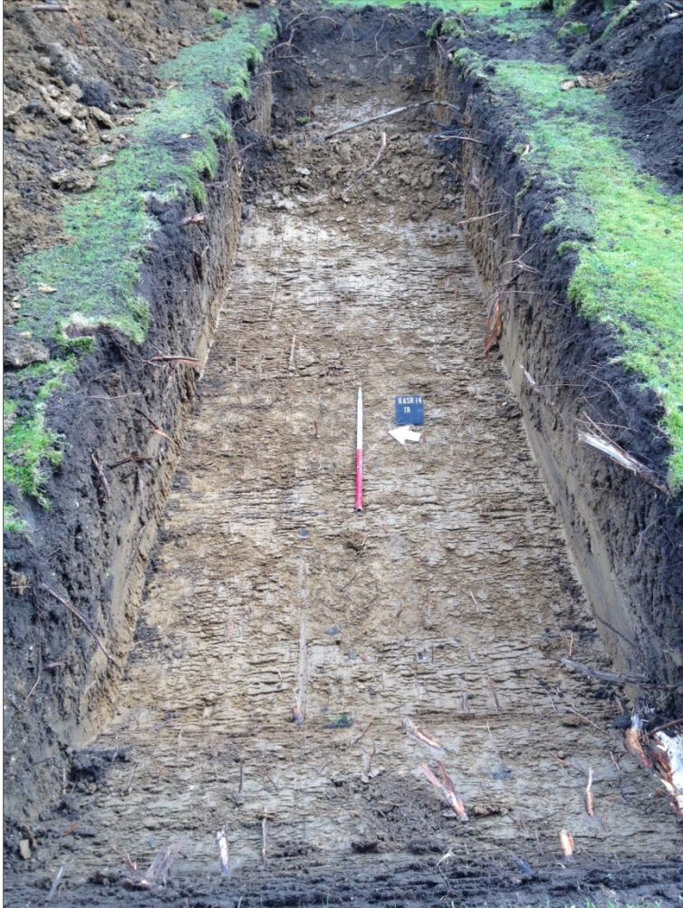
Figure 2: Excavated trench, looking northeast