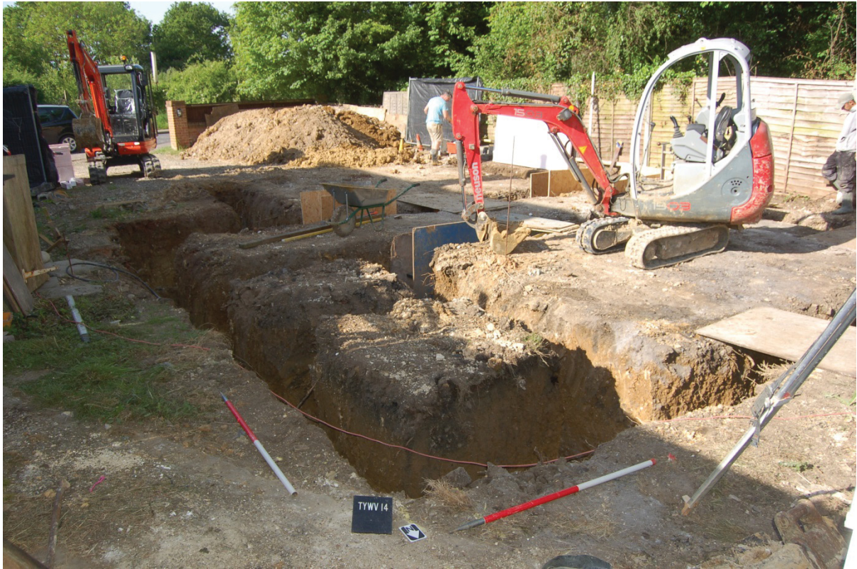
Fig. 2 Photograph of foundation trenches viewed to southwest