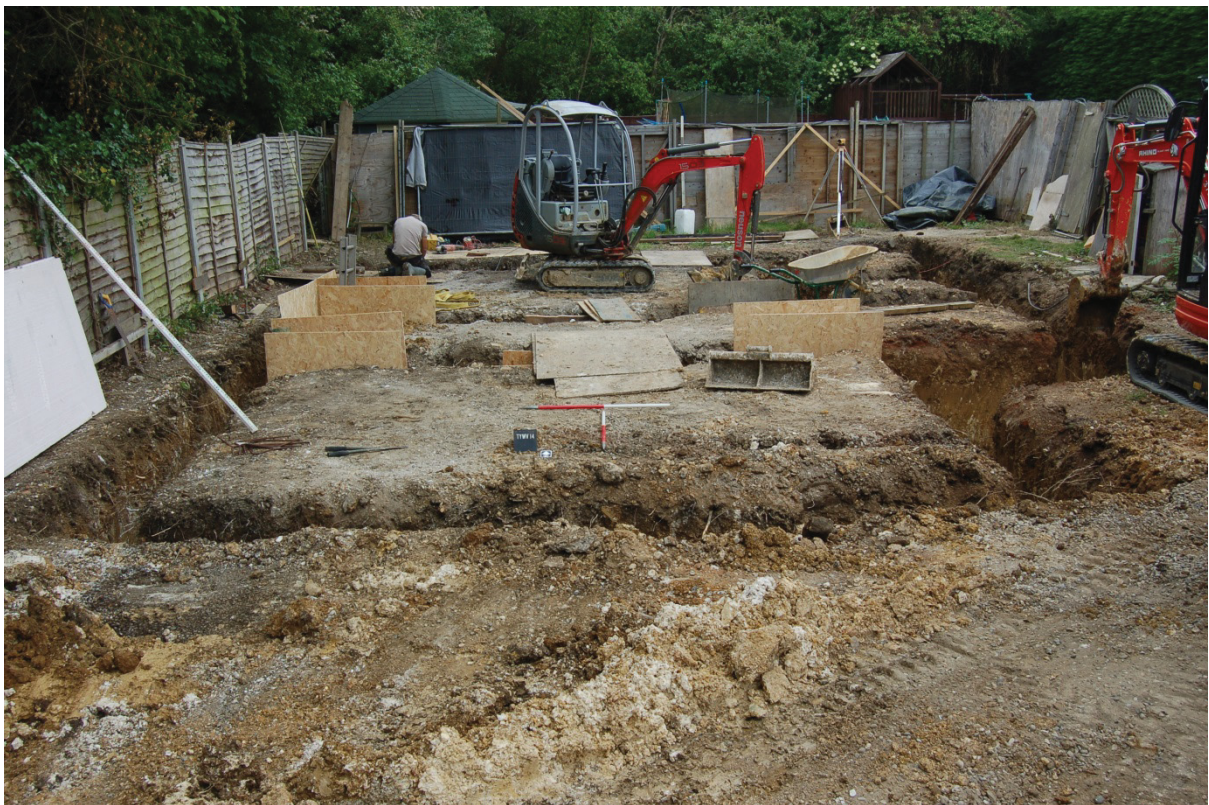
Fig. 3 Photograph of foundation trenches viewed to north