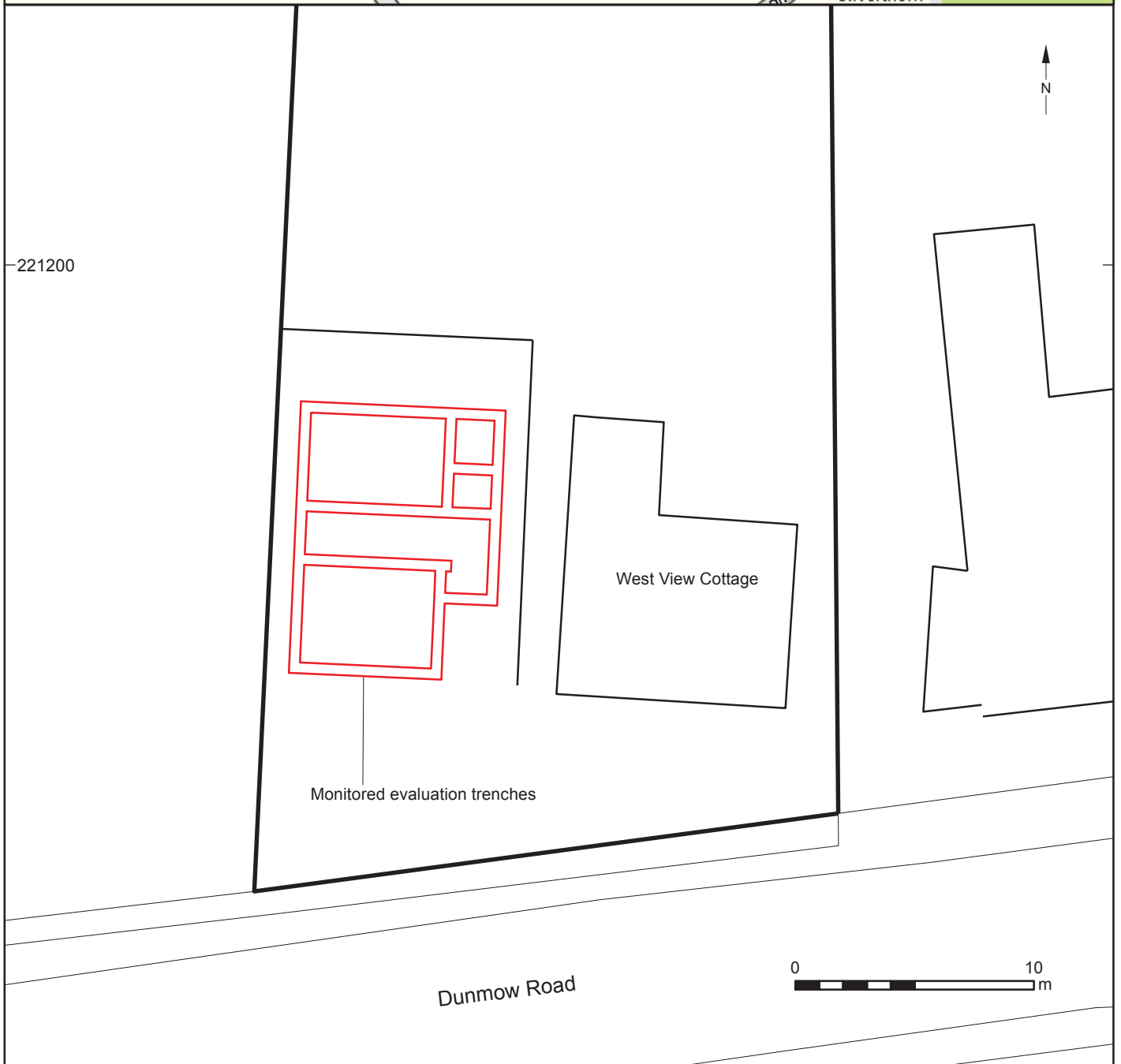
West View Cottage, Dunmow road, Takeley Fig. 1 Project Ref: 8157 Jun 2014 Location of monitored foundation trenches Report Ref: 2014191 Drawn by: APL