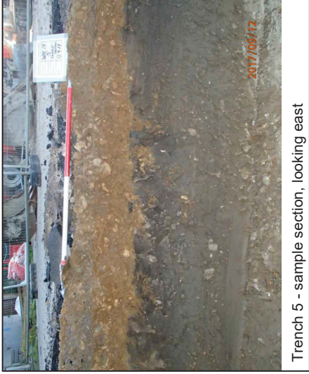
Trench 5 - sample section, looking east