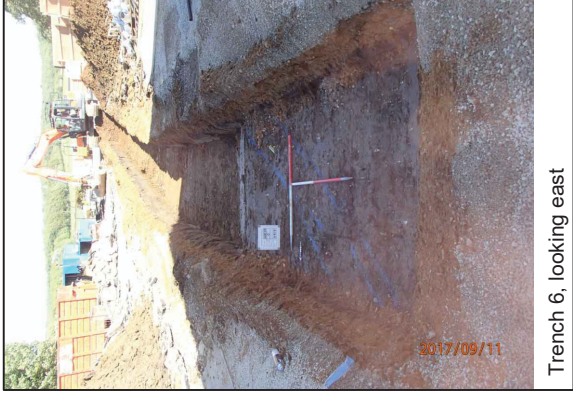
Trench 6, looking east