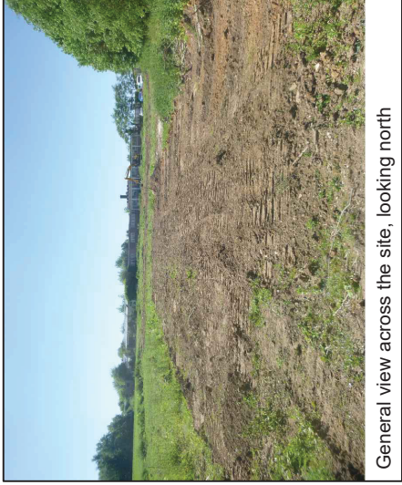
General view across the site, looking north