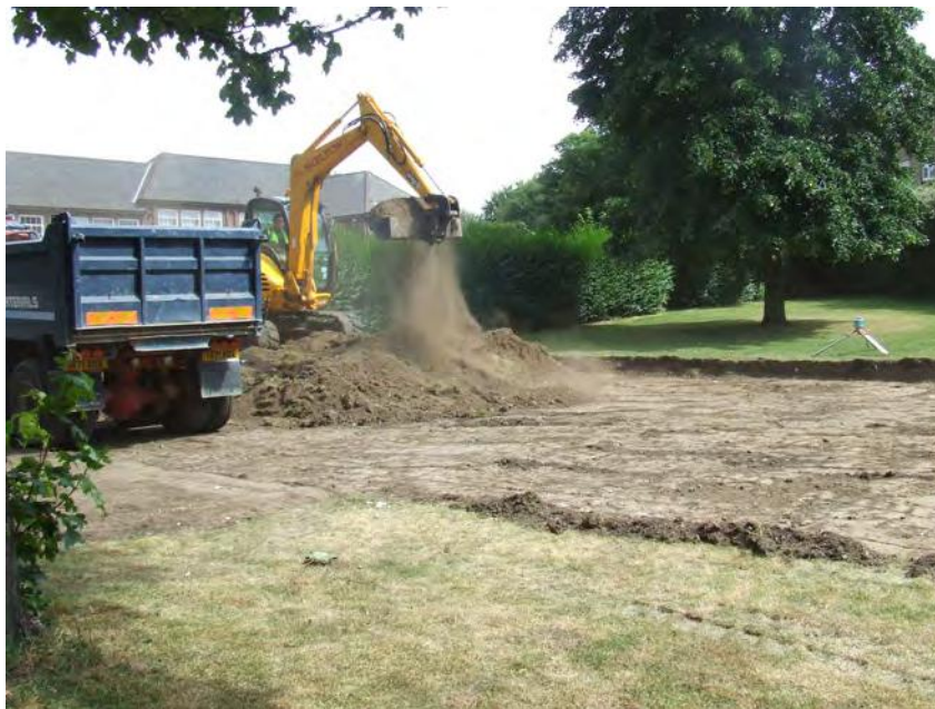
Fig.. 4: Stripping the topsoil