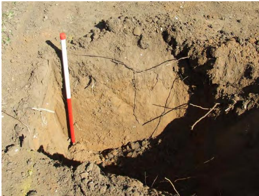
Fig.. 6: Detail of pad hole