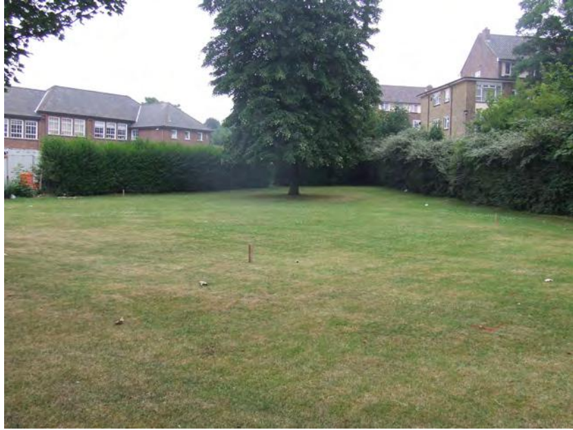
Fig. 3: The Site