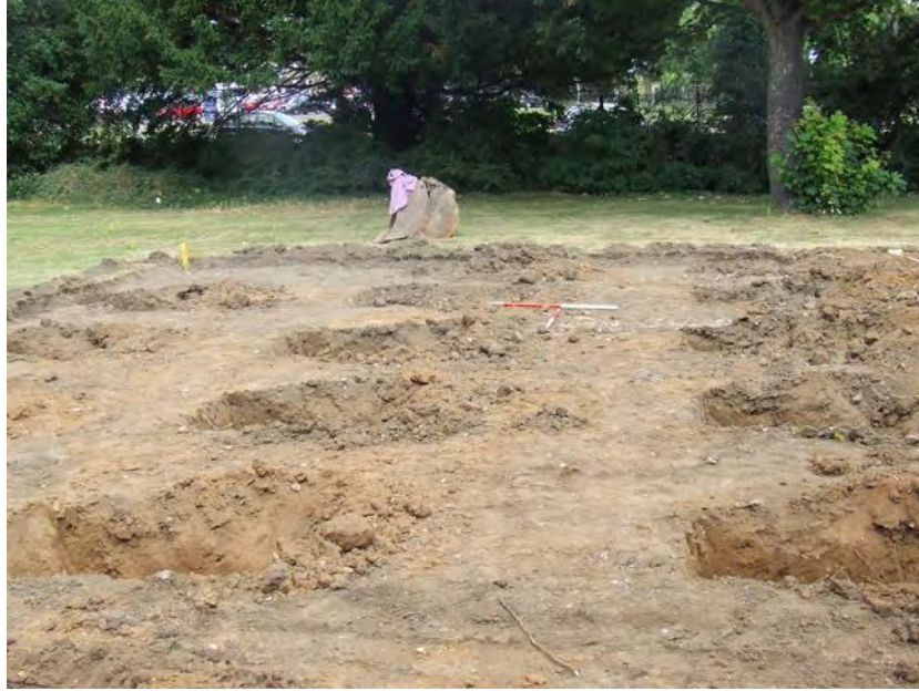
Fig. 5: Excavating the pad holes