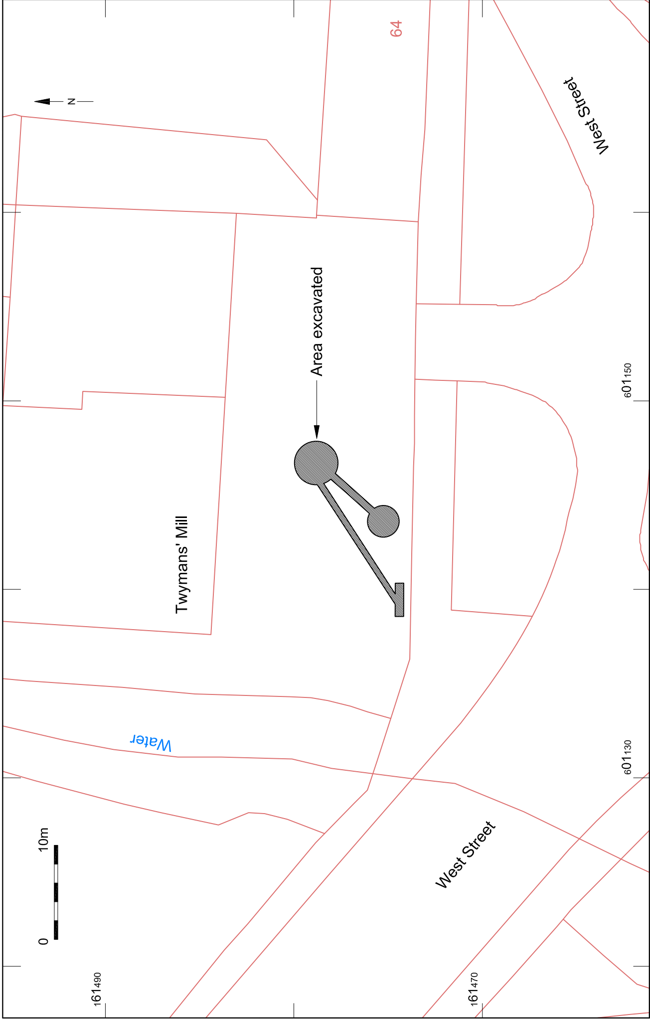
© Archaeology South-East Twymans' Mill, Faversham, Kent Project Ref: 3153 Jan 2008 Site Plan Report Ref: 2008177 Drawn by: DJH Fig. 2