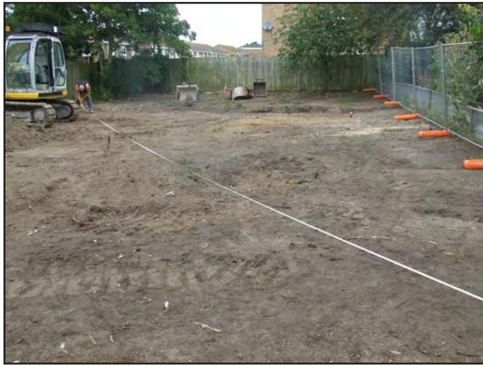
Figure 3: The Site