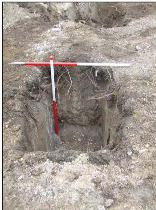
Figure 5: Pad Hole Section