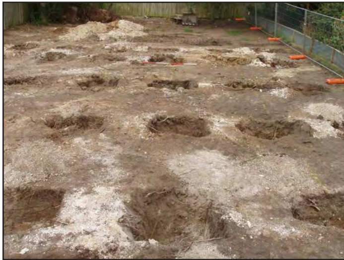
Figure 4: Pad Holes