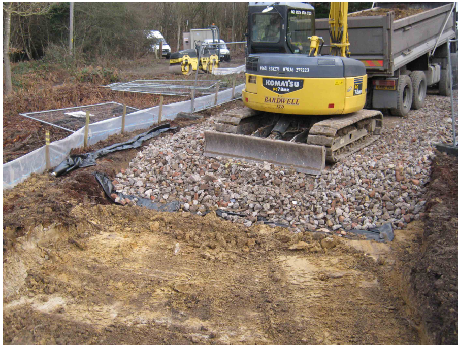
Strip facing east