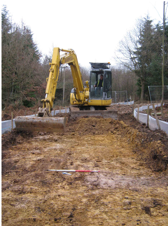
Strip facing north-east