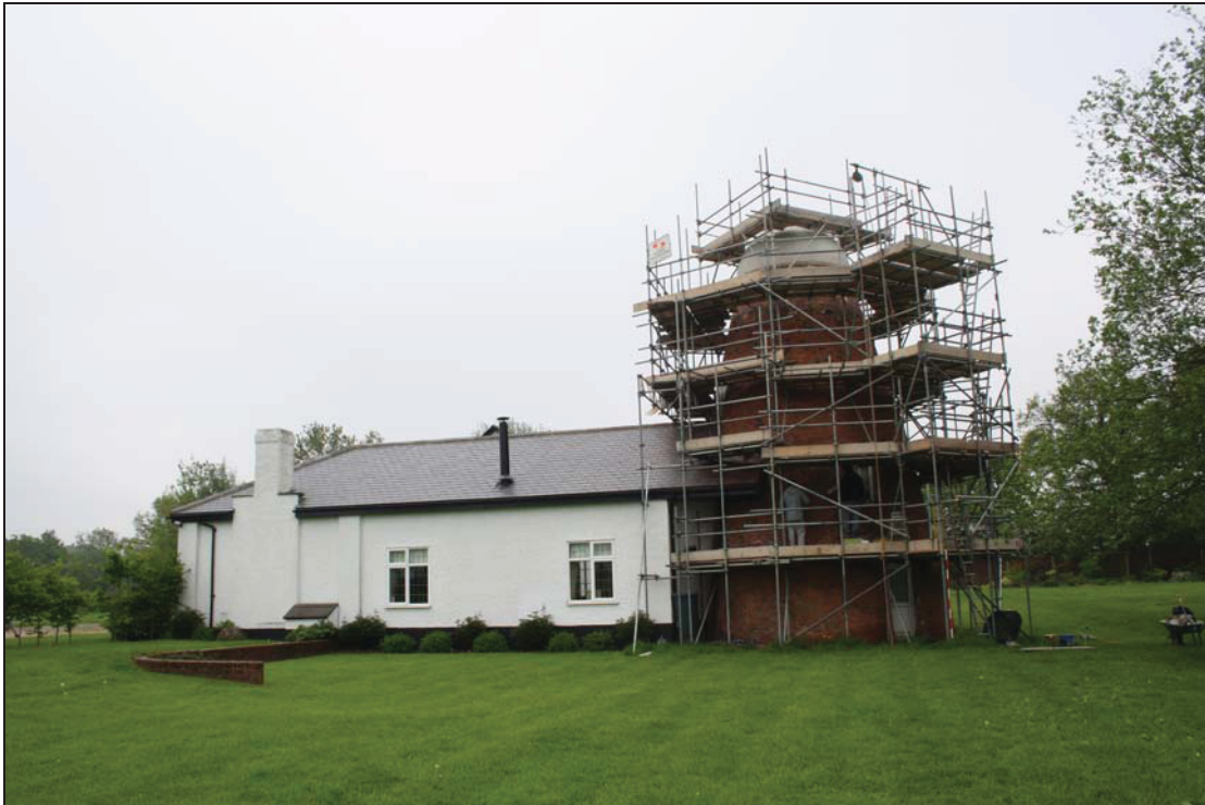
DP 01 North-east elevation of the mill tower with house to the south-east, taken from the north-east