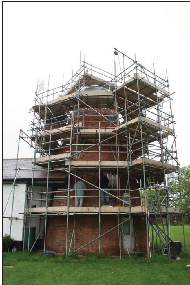
DP 02 North-east elevation of the mill tower, taken from the north-east