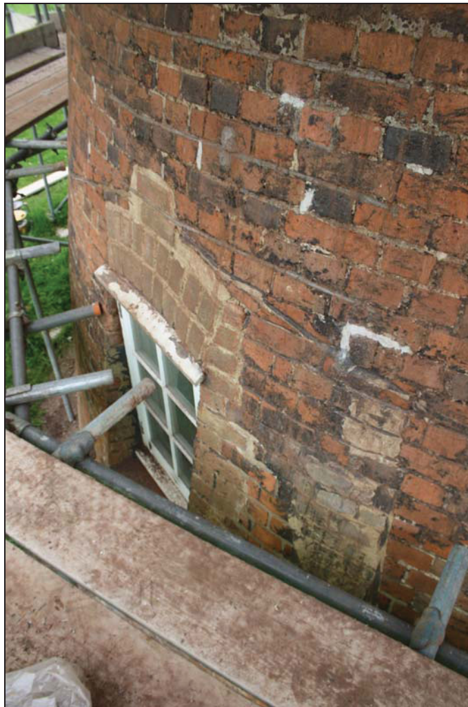
DP 09 Cambered arch over casement window on the west side at ground floor level with repaired brickwork, taken from the south-west