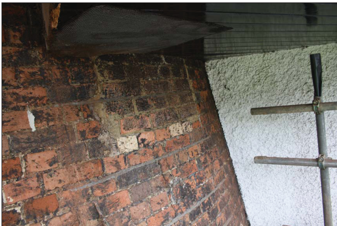
DP 10 Blocked aperture on the south side of the mill tower at Level 2, taken from the west