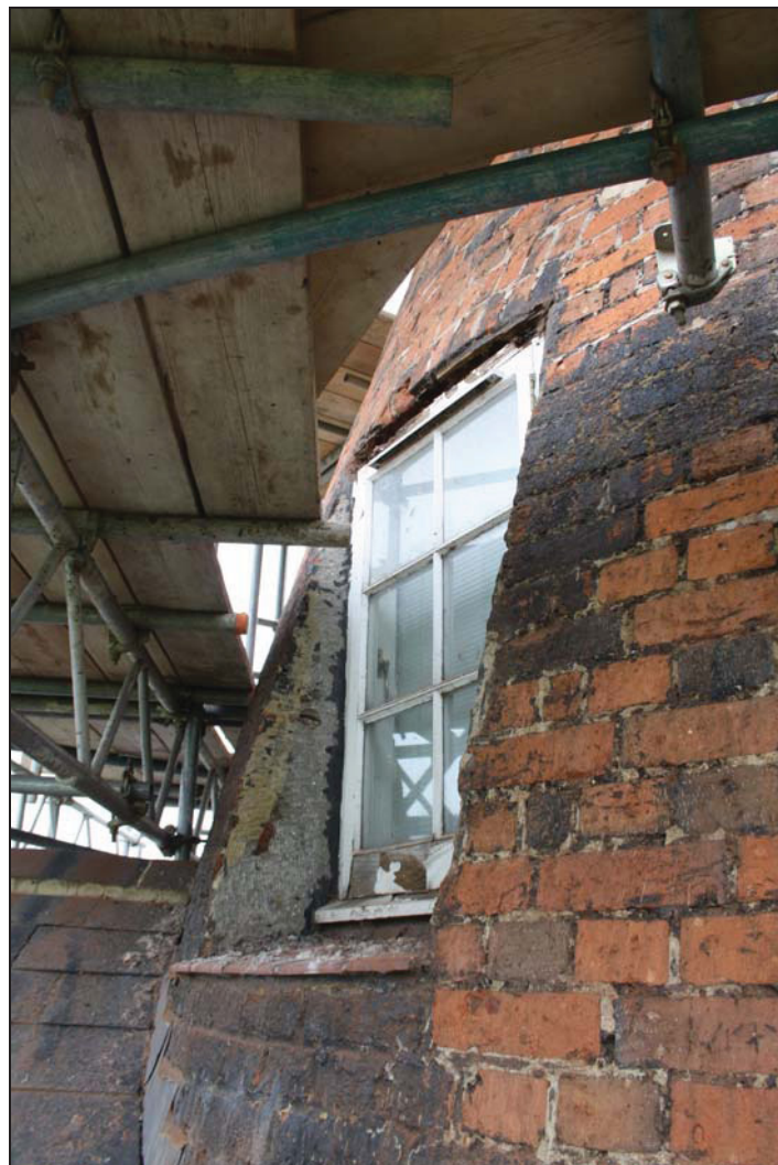
DP 12 Casement window on the west side at Level 3, taken from the north-east