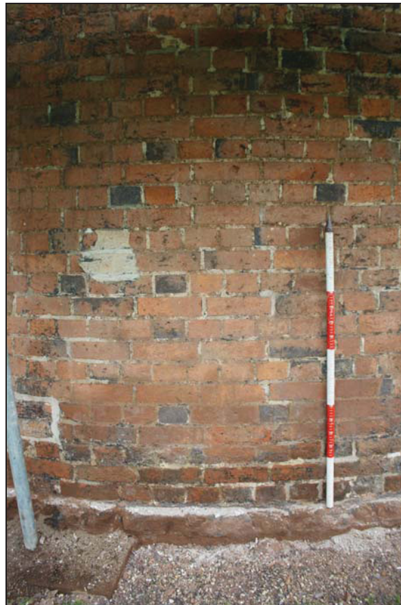
DP 07 Sample of English bond brickwork at ground floor level, taken from the north-West