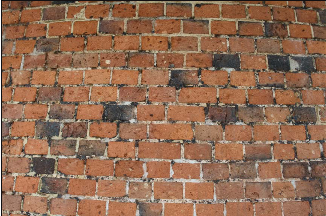
DP 13 Sample of header bond brickwork at Level 4, taken from the north-west