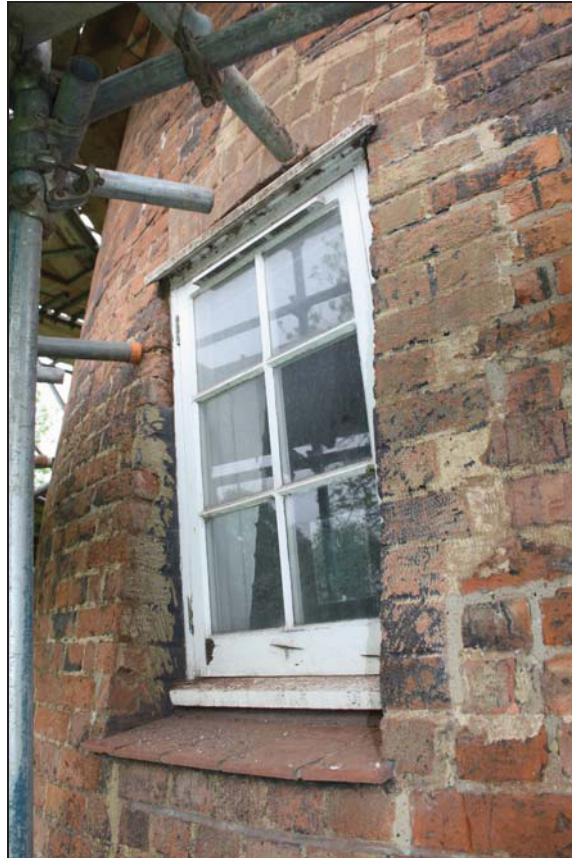
DP 08 Casement window on the west side at ground floor level, taken from the south-west