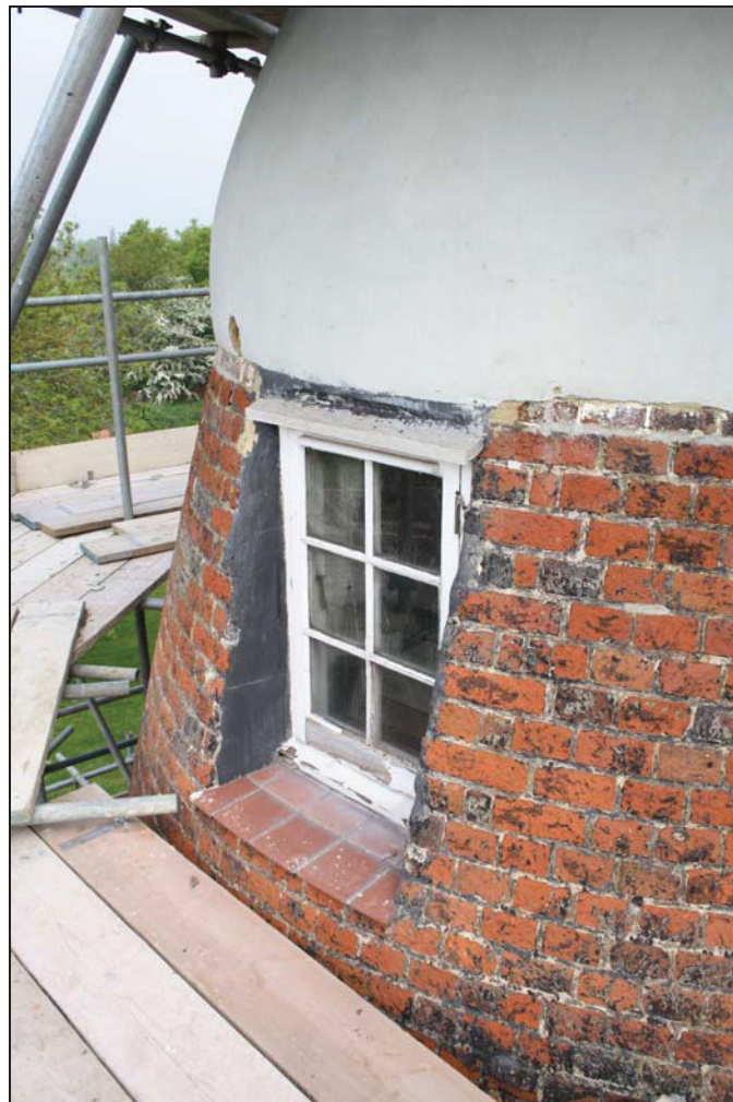
DP 16 Casement window on the south side of the mill tower at Level 5, taken from the south-east