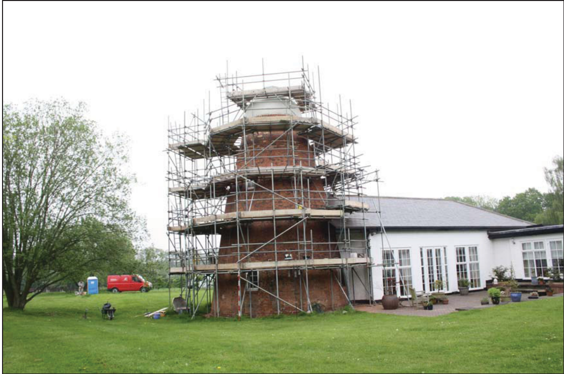
DP 05 West side of the mill tower with the house to the rear, taken from the west