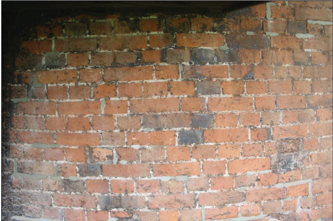
DP 11 Sample of brickwork laid in a variable bond at level 2, taken from the east