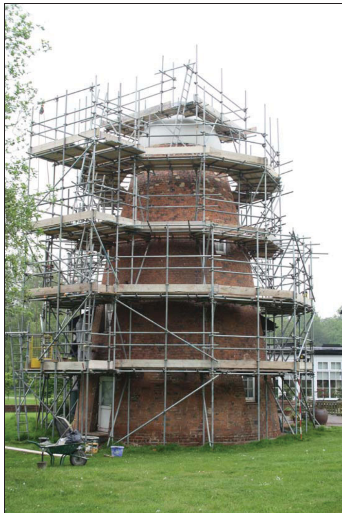
DP 04 North side of the mill tower, taken from the north