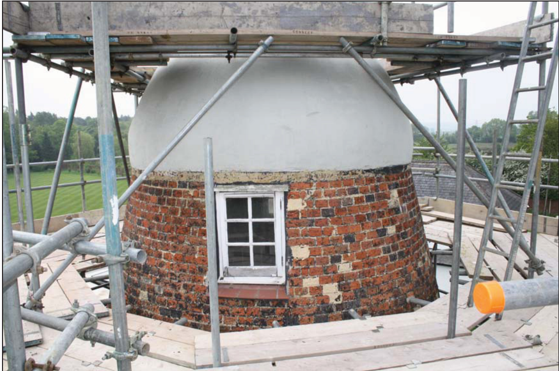
DP 15 North side of the mill tower at Level 5 showing casement window, taken from the north-west