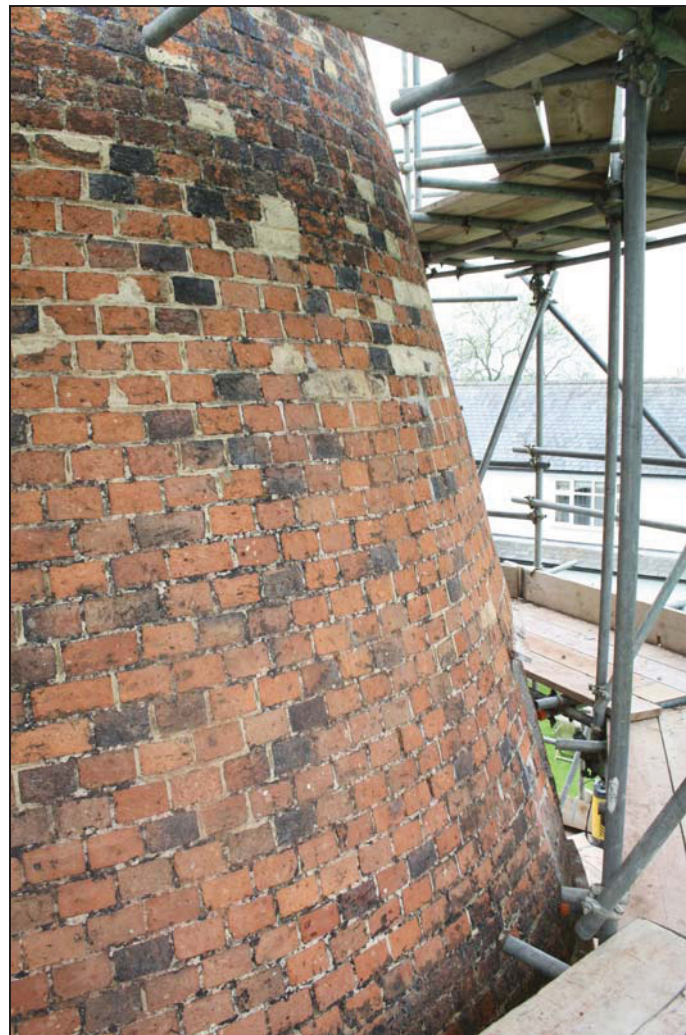
DP 14 Header bond brickwork at Level 4, taken from the north-east