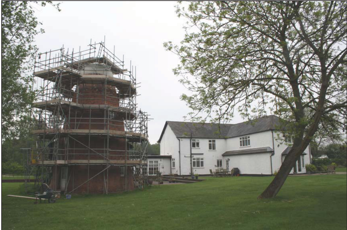
DP 03 North side of the mill tower with house to the rear, taken from the north