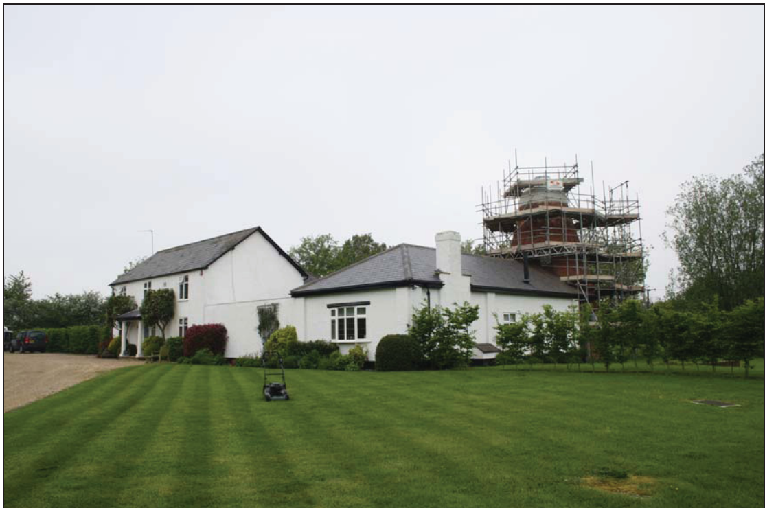
DP 06 View of the house with the mill tower to the rear, taken from the east