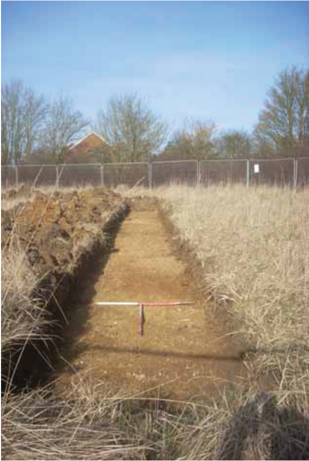
1 Trench 5 looking North-East.