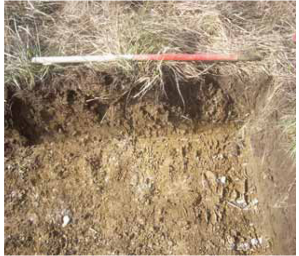
2 Sample Section 1A, Trench 1 looking North-West