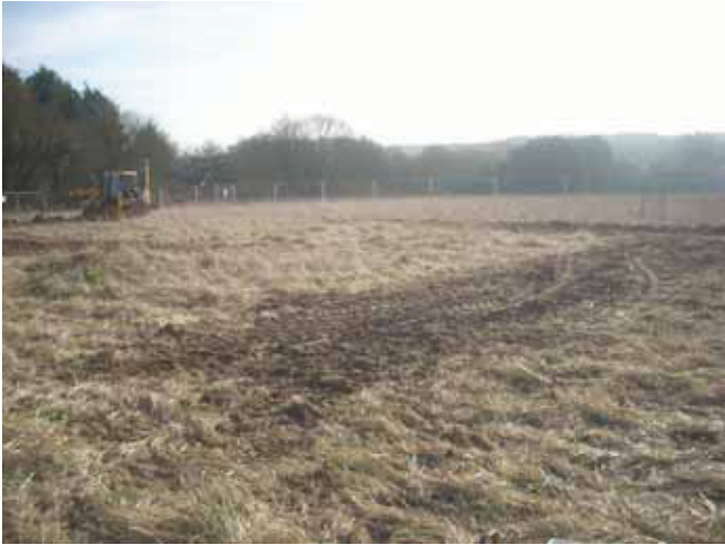
3 General site photograph looking South-East