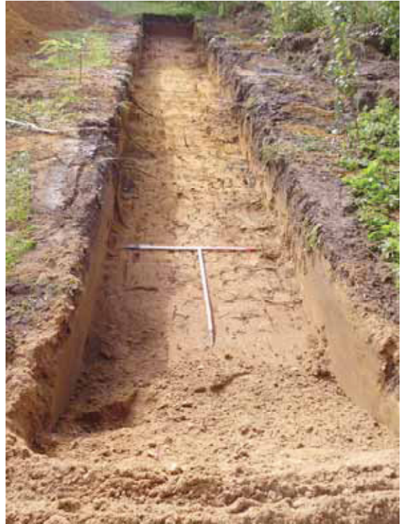
DP 2: Trial Trench 1 (post-excitation), looking S