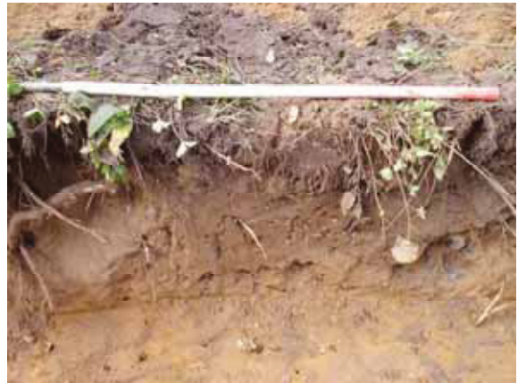
DP 4: Sample Section 1B, Looking W