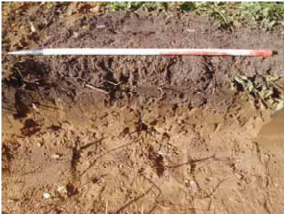
DP 3: Sample Section 1A, looking W