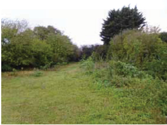
DP 1: Site (pre-excitation), looking S