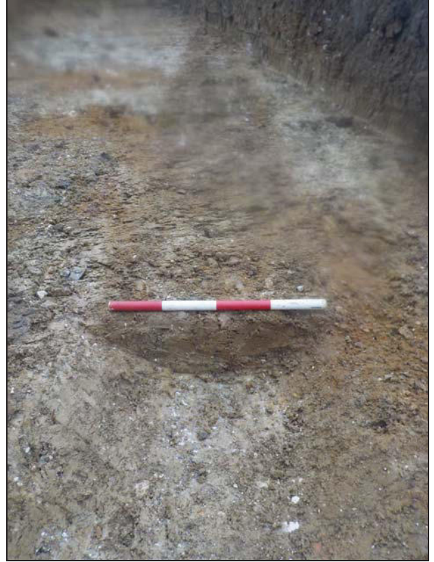
2 F1004 in Trench 2 looking south-west