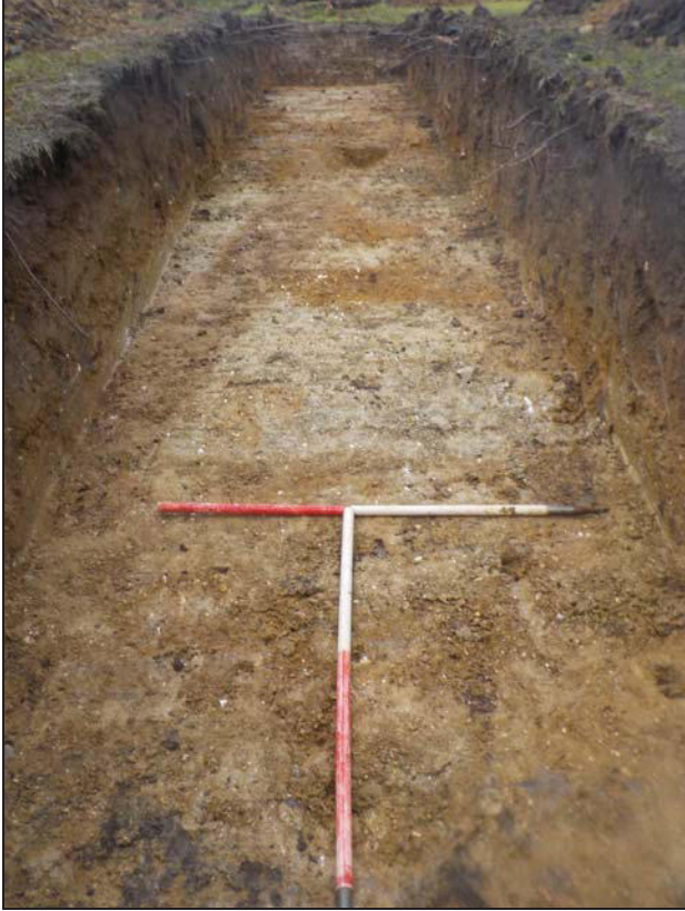
1 Post-excavation view of Trench 2 looking north