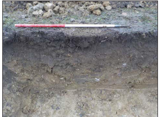
4 Sample Section 2B in Trench 2 looking west