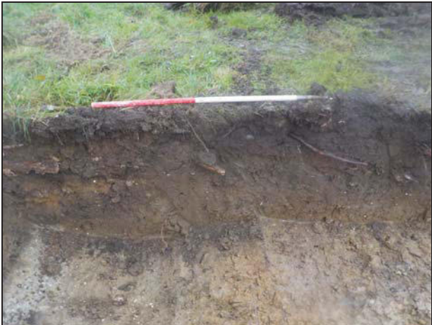
3 F1006 and Sample Section 2A in Trench 2 looking east