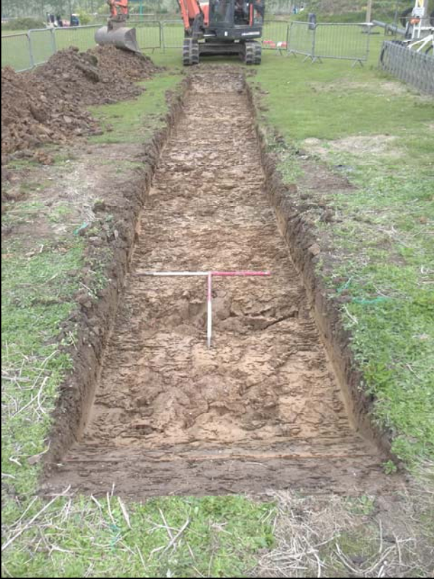
1 View of Trench 1 looking north-west