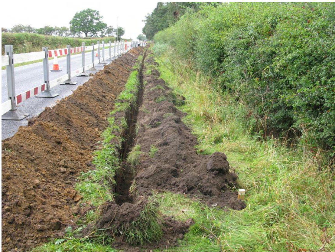
Plate 6 Trench 2 along Top Road, viewed from the east.