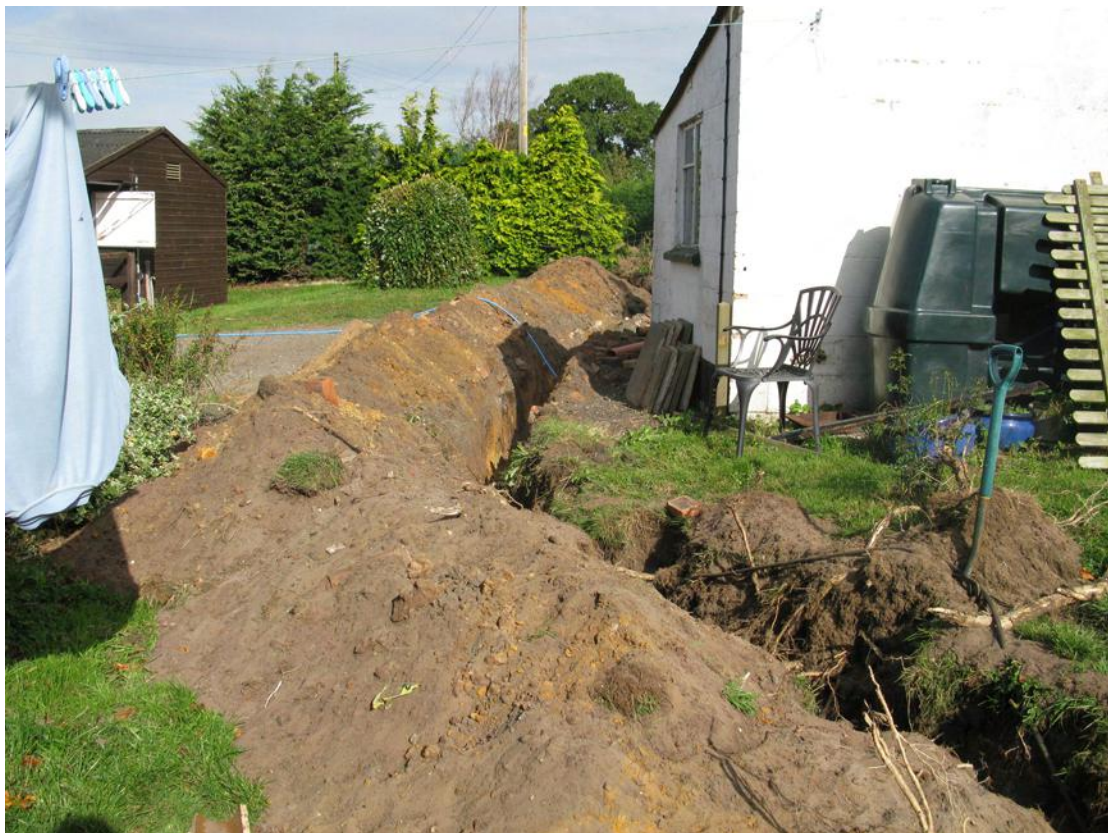
Plate 10 Trench 4 skirting the buildings at Field Farm.