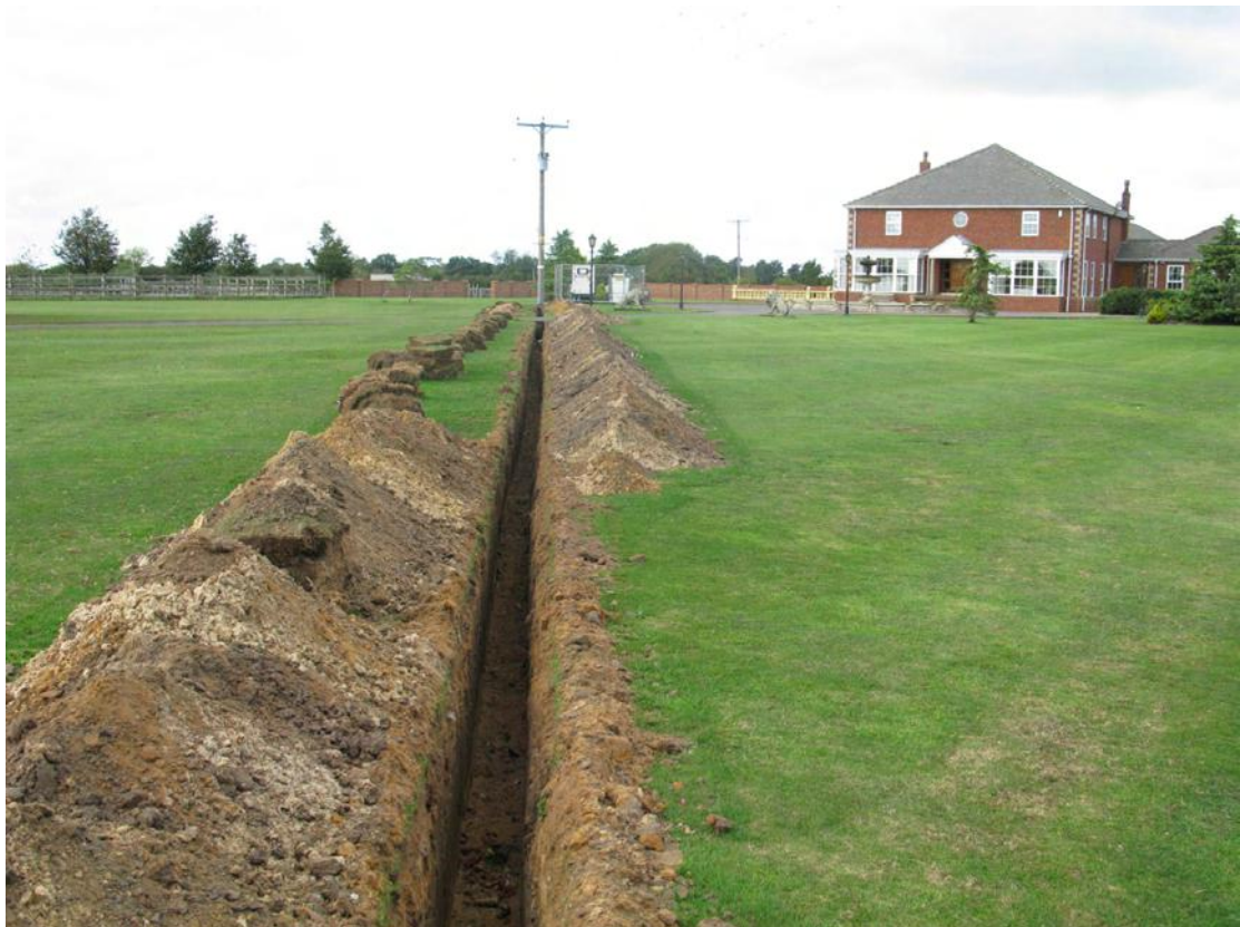
Plate 14 Trench 7, looking southeast.