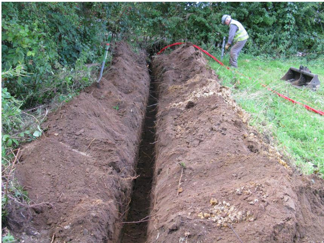
Plate 8 Northern arm of trench 2 looking east.