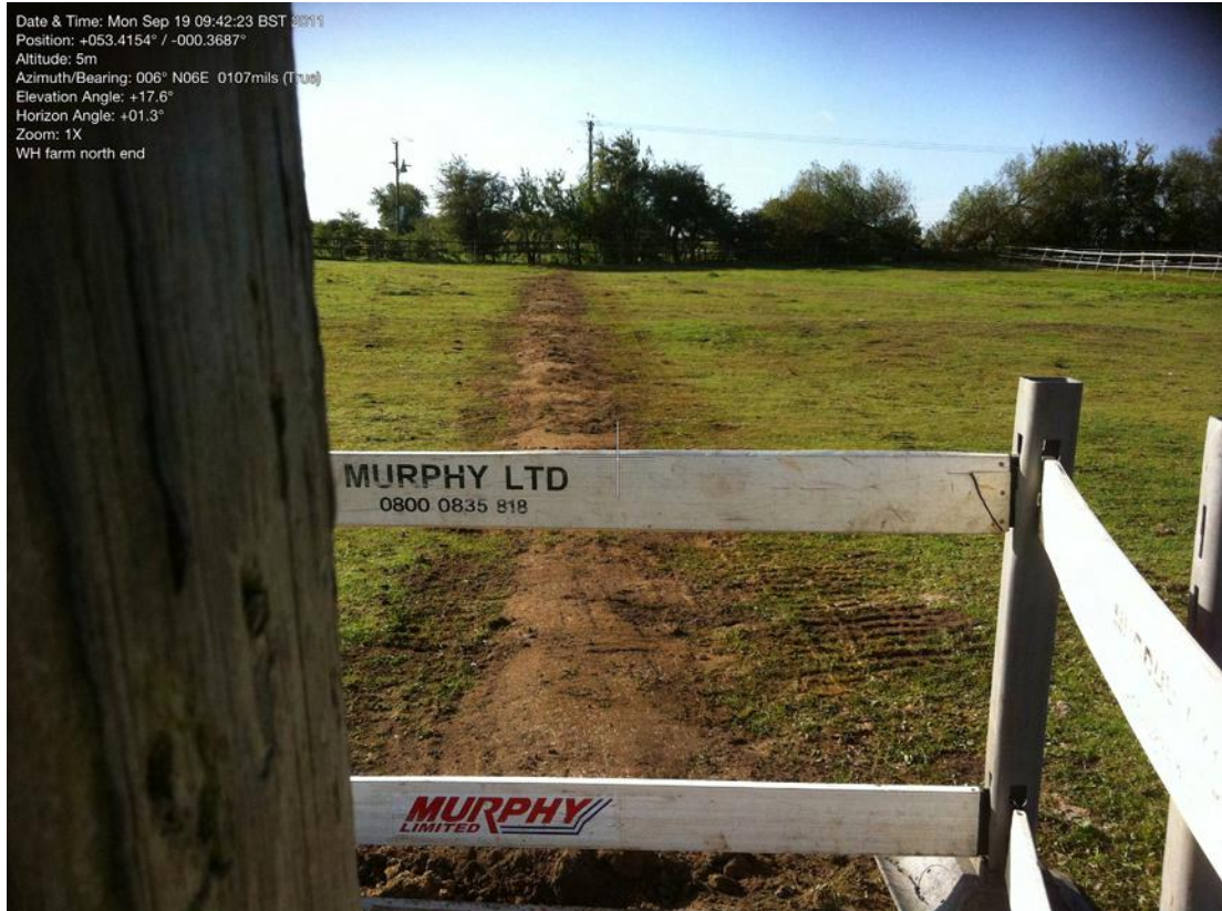
Plate 11 Trench 5 after back-filling, viewed from the south.