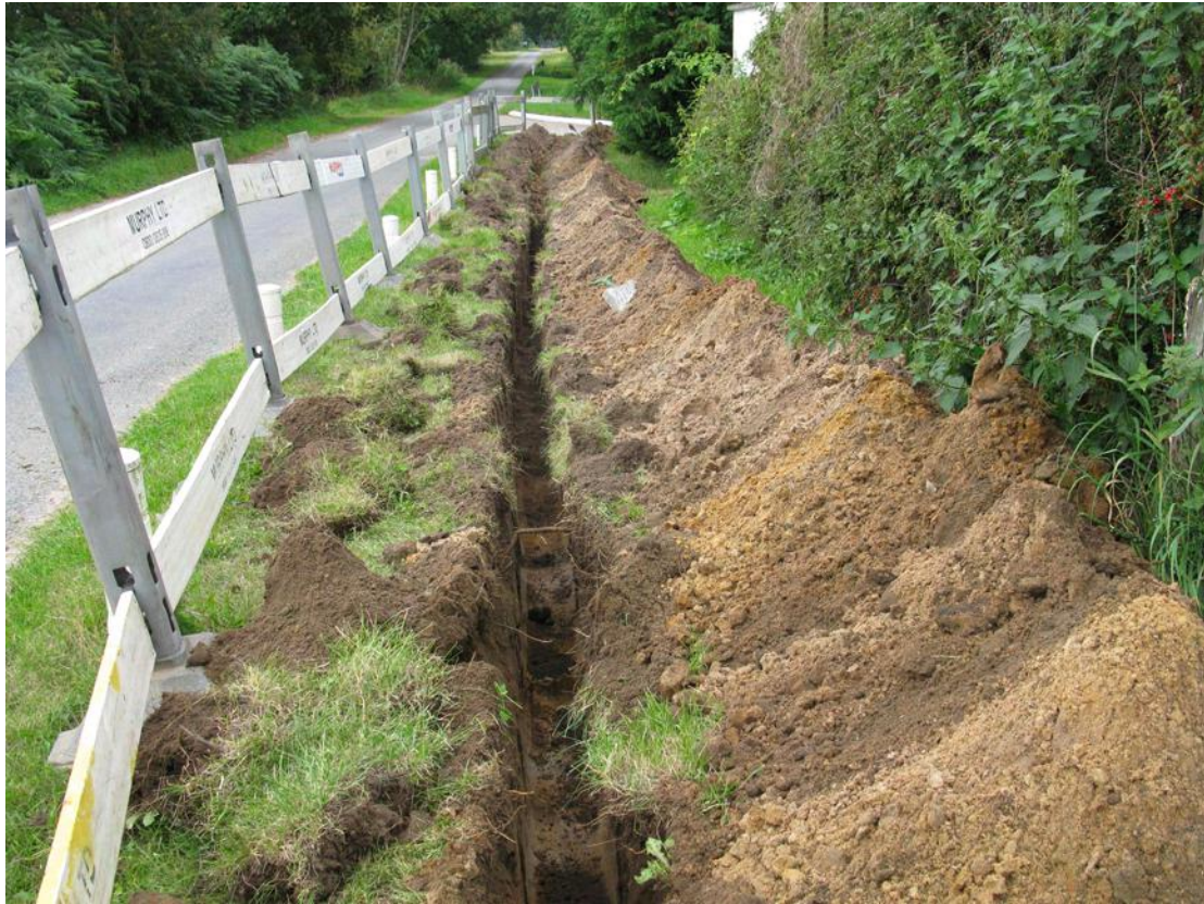
Plate 7 Trench 2 Sand Lane, viewed from the south