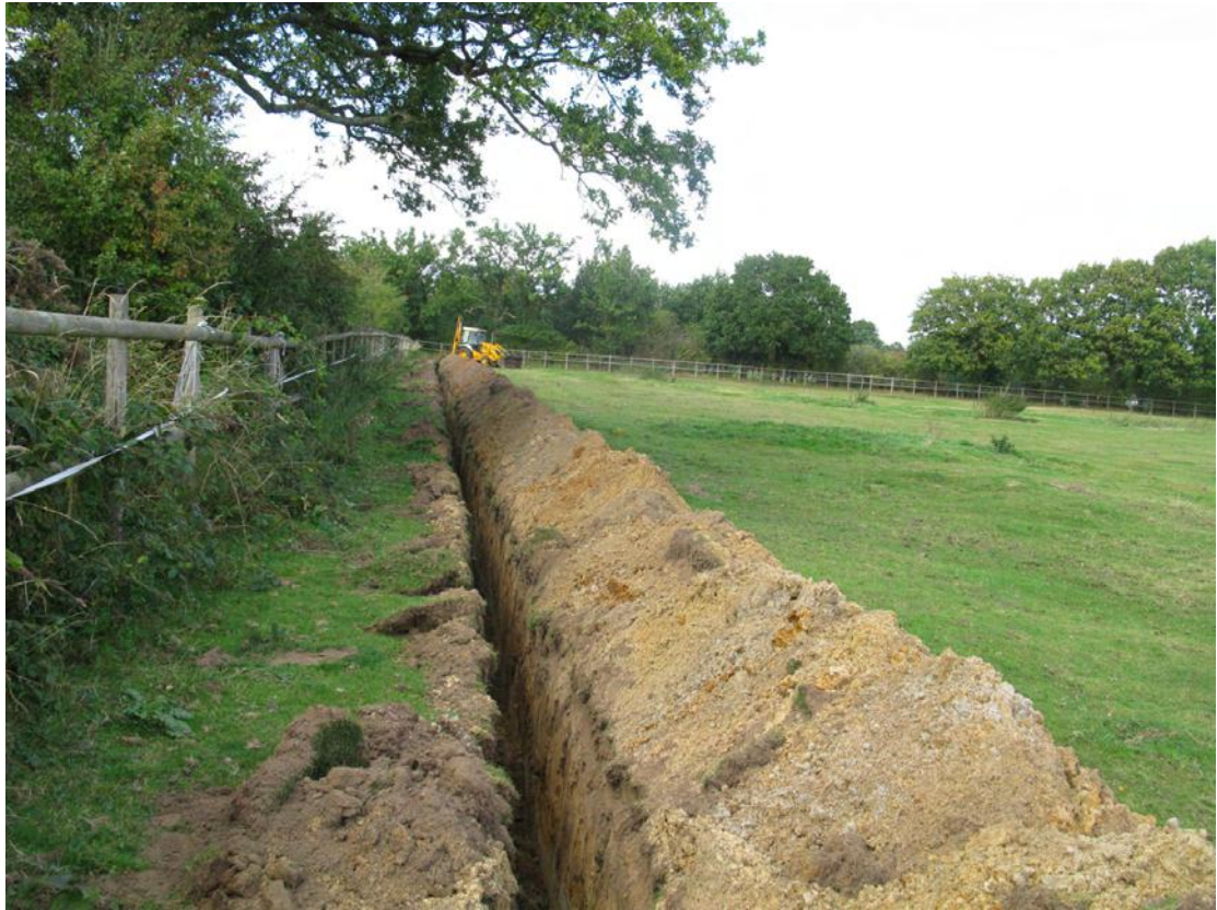
Plate 13 The eastern arm of trench 6, looking north.