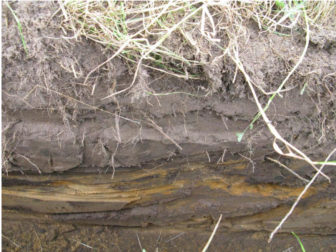
Plate 5 Section showing the deposits revealed in the southern part of trench 1