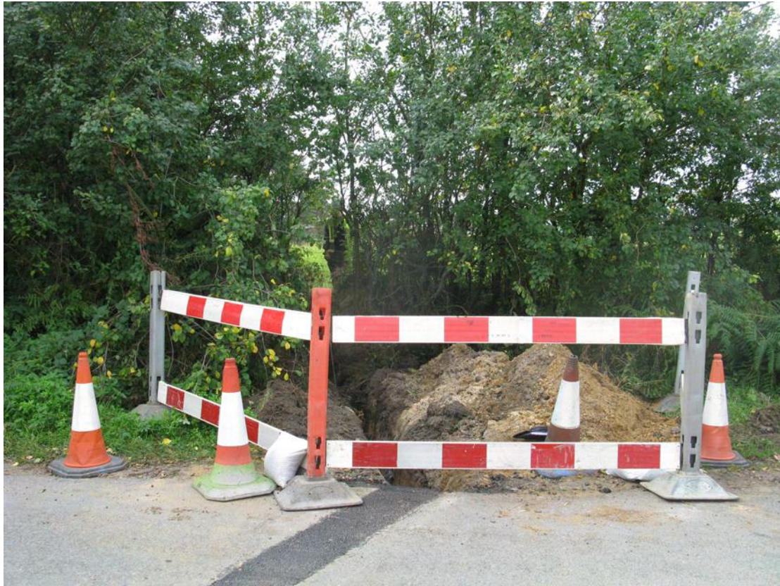
Plate 9 Trench 3 entering 'Cowdyke' field.