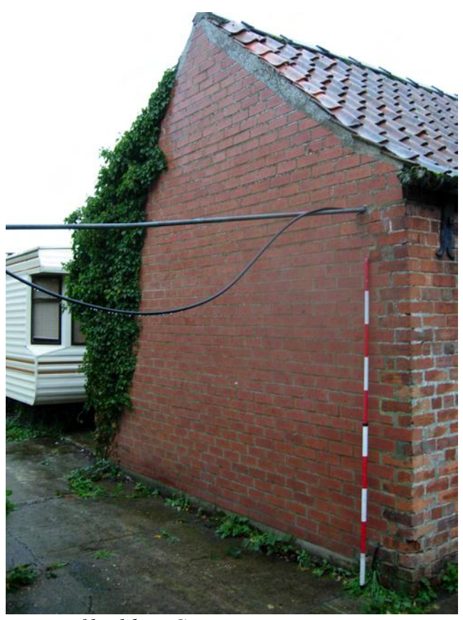
Plate 11 West elevation of building C