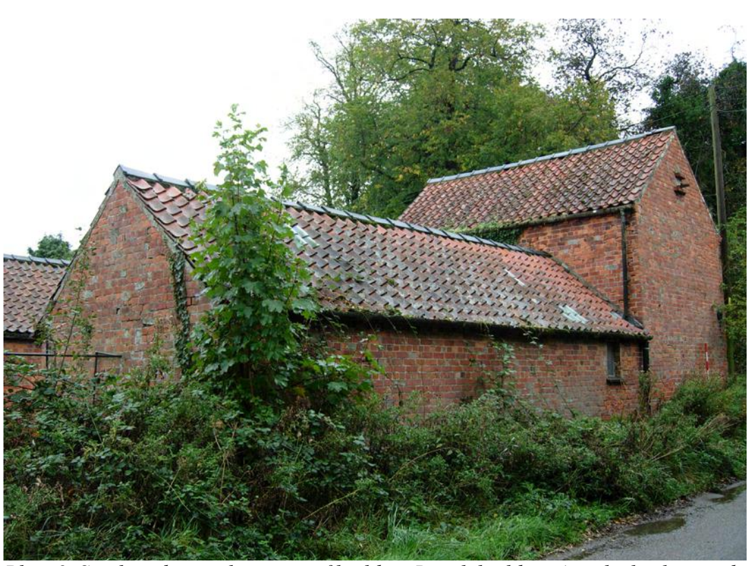
Plate 8 South and west elevations of building B with building A in the background