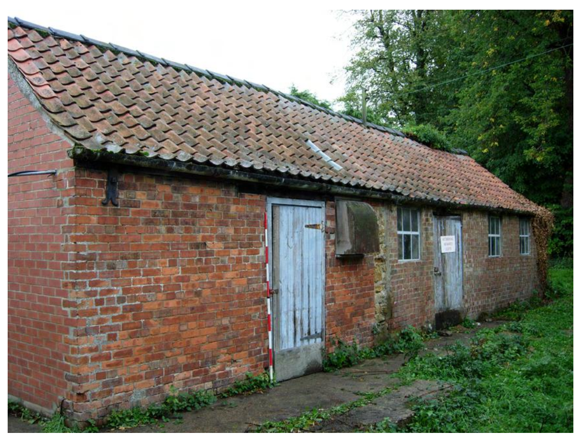
Plate 9 South elevation of building C