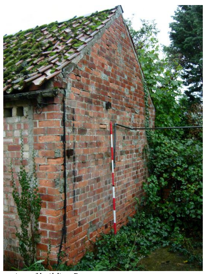
Plate 7 West elevation of building B