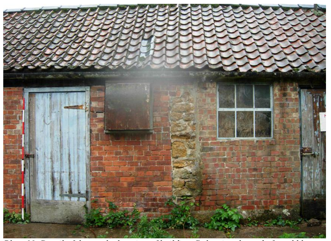
Plate 10 Detail of the south elevation of building C showing the end of a rubble-stone wall