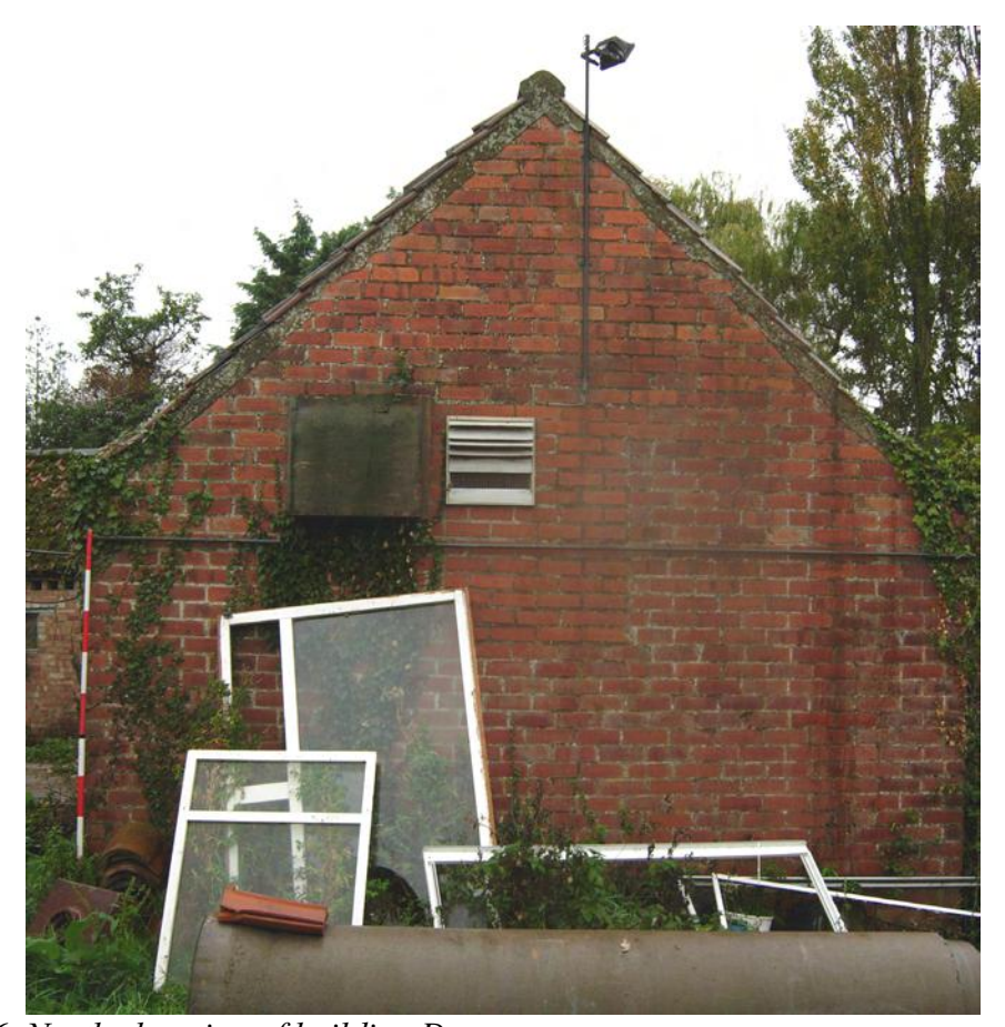
Plate 16 North elevation of building D