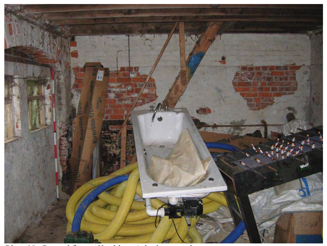
Plate 18 Ground floor of building A, looking south