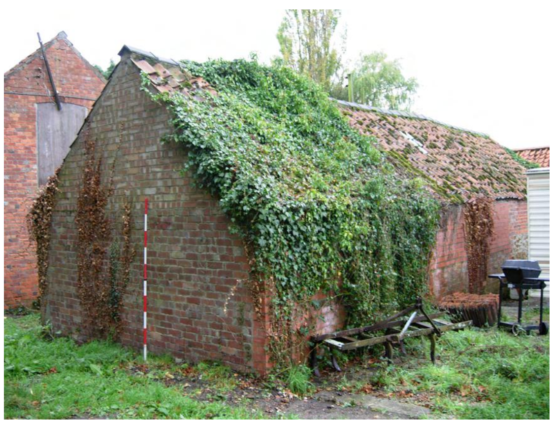
Plate 12 East elevation and part of the north elevation of building C