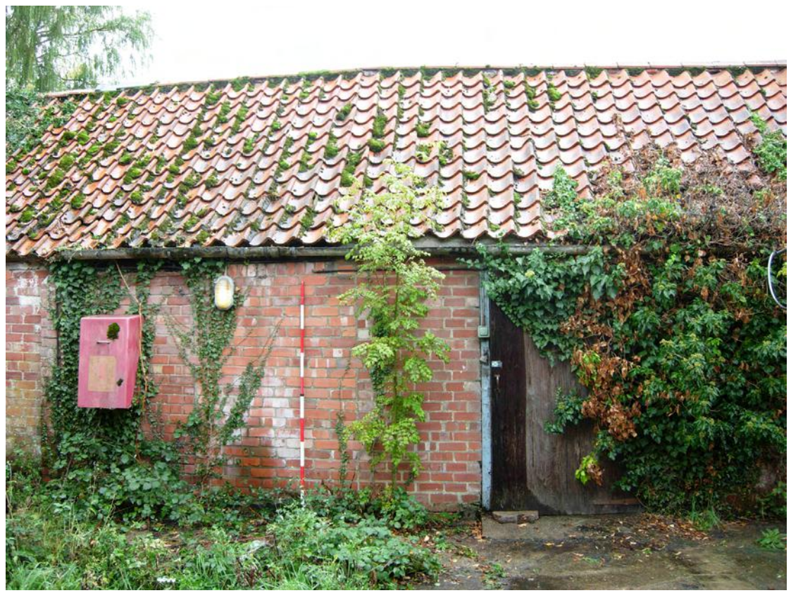
Plate 15 Central portion of the east elevation of building D