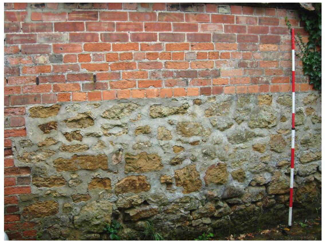
Plate 13 Rubble-stone walling in the western portion of the north elevation of building C