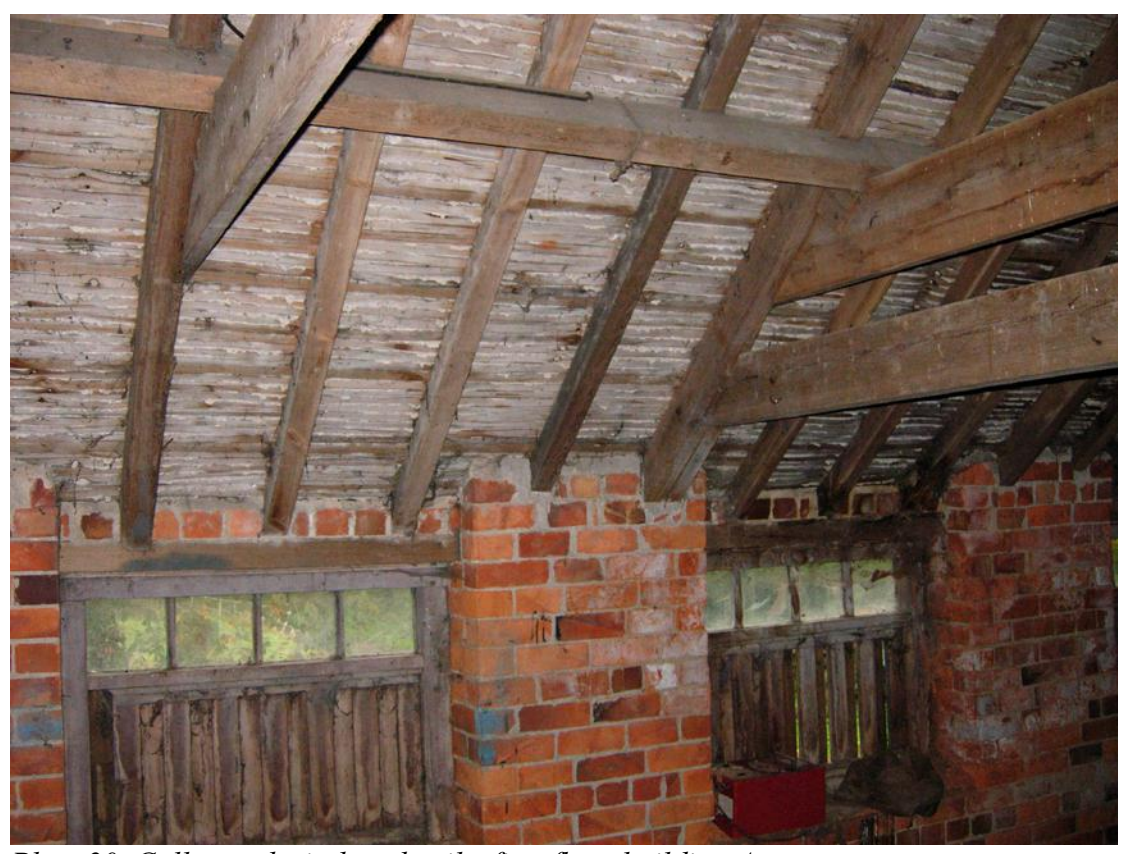
Plate 20 Collar and window details, first floor building A