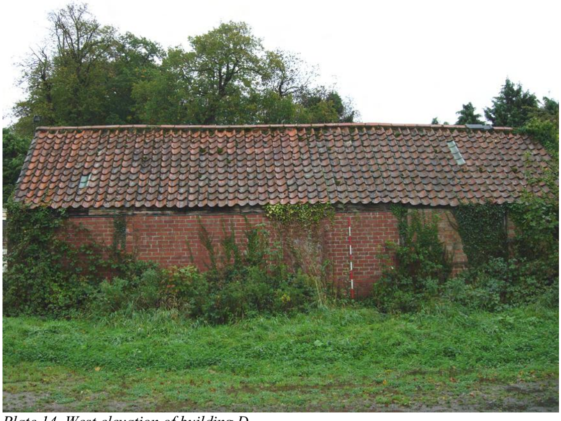
Plate 14 West elevation of building D