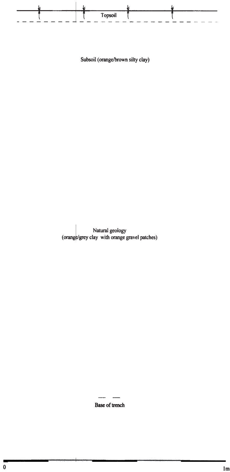
Figure 4. Representative section of footing trench.