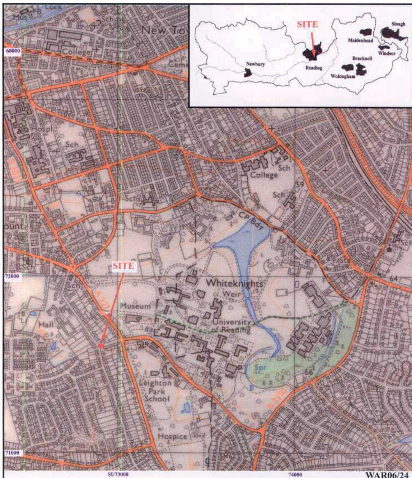
Figure 1. Location of site within Reading and Berkshire.