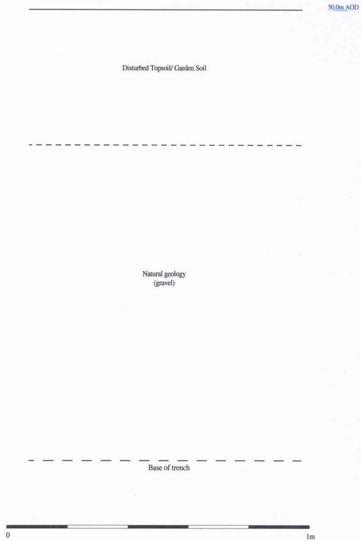
Figure 4. Representative section of footing trench