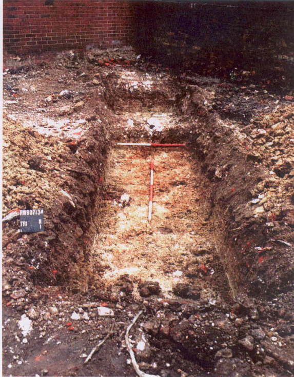
Plate 1. Trench 1 looking north, horizontal scales 2m and 1m.