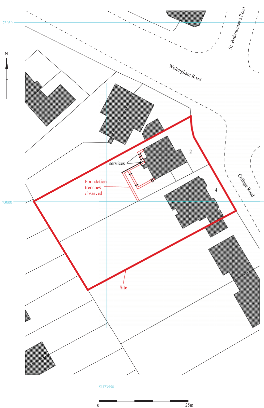
Figure 3. Layout of the foundation trenches.