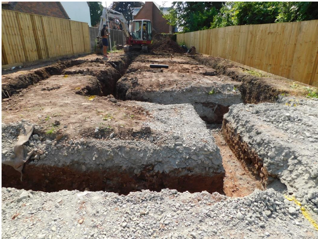
Plate 1: View W of foundation excavations

The service trench excavation revealed an area of disturbance on the S side of the site, containing occasional flecks of ceramic building material and charcoal. It is suggested, therefore, that pit [106], the edges of which could not be established, may have been present for the full width of the site. Pottery seen in [106] was of post-medieval or later post-medieval date. Furthermore, substantial dumps of post-medieval building material were seen at the entrance to the site, suggesting levelling/landscaping activity, again probably during the later post-medieval period. It therefore seems likely that disturbance had taken place over the entire site potentially removing any earlier archaeological features/deposits that may have been present.