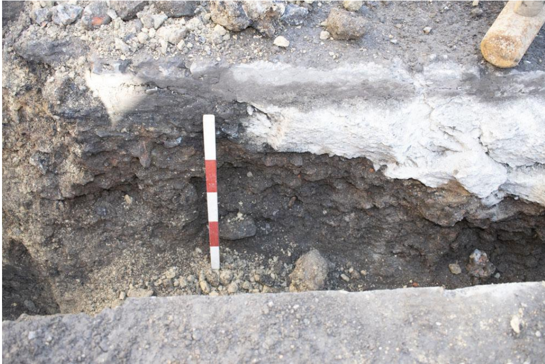
Plate 3 South-west facing trench section, view north-east, 0.1m scale units

This Report has been prepared solely for the person/party which commissioned it and for the specifically titled project or named part thereof referred to in the Report. The Report should not be relied upon or used for any other project by the commissioning person/party without first obtaining independent verification as to its suitability for such other project, and obtaining the prior written approval of York Archaeological Trust for Excavation & Research Limited ("YAT"). YAT accepts no responsibility or liability for the consequences of this Report being relied upon or used for any purpose other than the purpose for which it was specifically commissioned. Nobody is entitled to rely upon this Report other than the person/party which commissioned it. YAT accepts no responsibility or liability for any use of or reliance upon this Report by anybody other than the commissioning person/party.