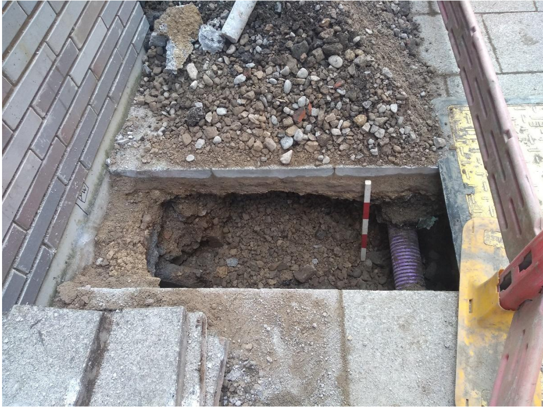
Plate 2 Services below pavement, view south-west, 0.1m scale units