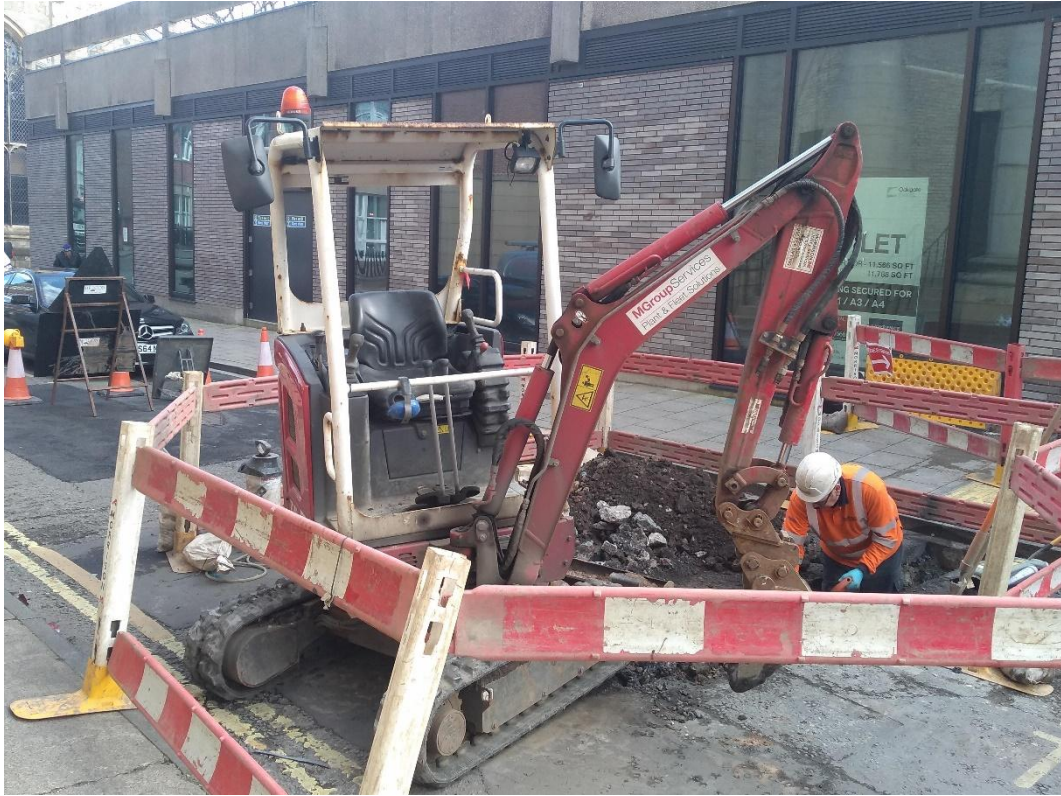
Plate 1 Ground works across St. Saviourgate in progress, view south-east