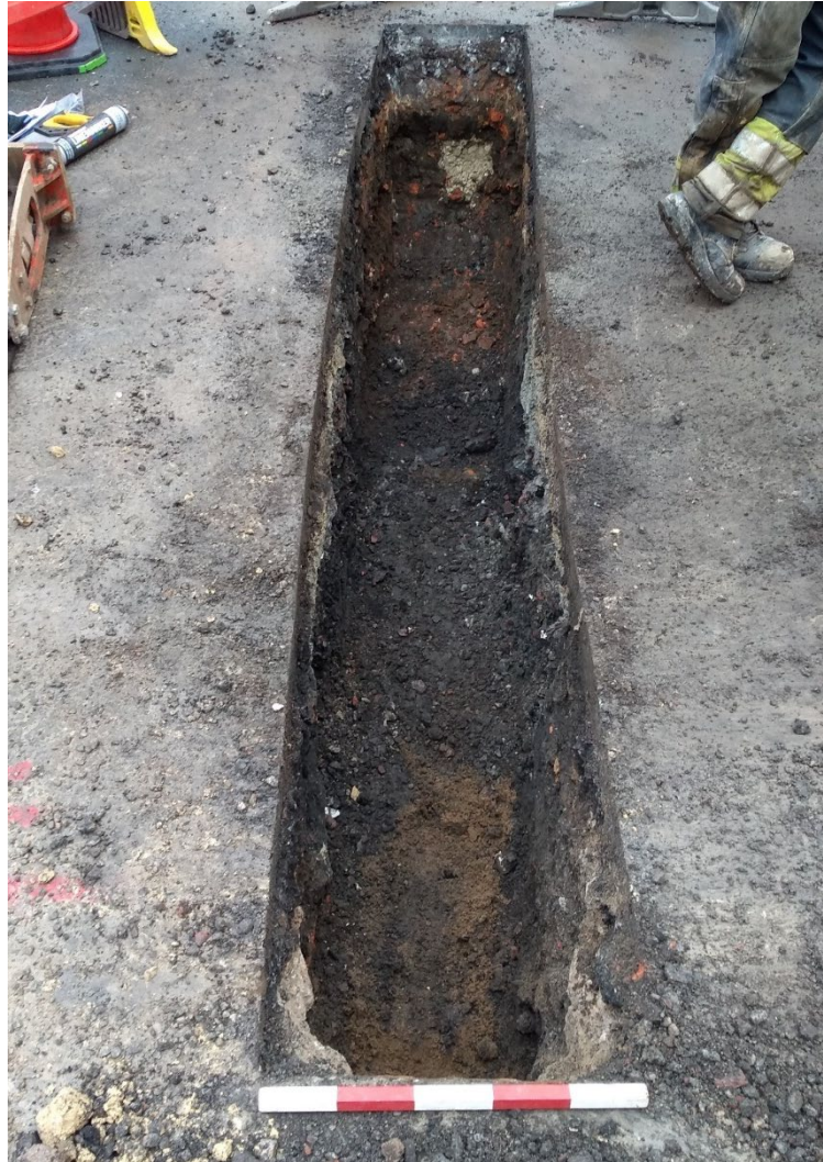
Plate 2 General view of excavated trench, facing north-east. 0.1m scale units