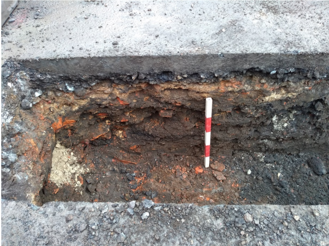
Plate 3 North-west end of south-west facing section, facing north-east. 0.1m scale units

This Report has been prepared solely for the person/party which commissioned it and for the specifically titled project or named part thereof referred to in the Report. The Report should not be relied upon or used for any other project by the commissioning person/party without first obtaining independent verification as to its suitability for such other project, and obtaining the prior written approval of York Archaeological Trust for Excavation & Research Limited ("YAT"). YAT accepts no responsibility or liability for the consequences of this Report being relied upon or used for any purpose other than the purpose for which it was specifically commissioned. Nobody is entitled to rely upon this Report other than the person/party which commissioned it. YAT accepts no responsibility or liability for any use of or reliance upon this Report by anybody other than the commissioning person/party.