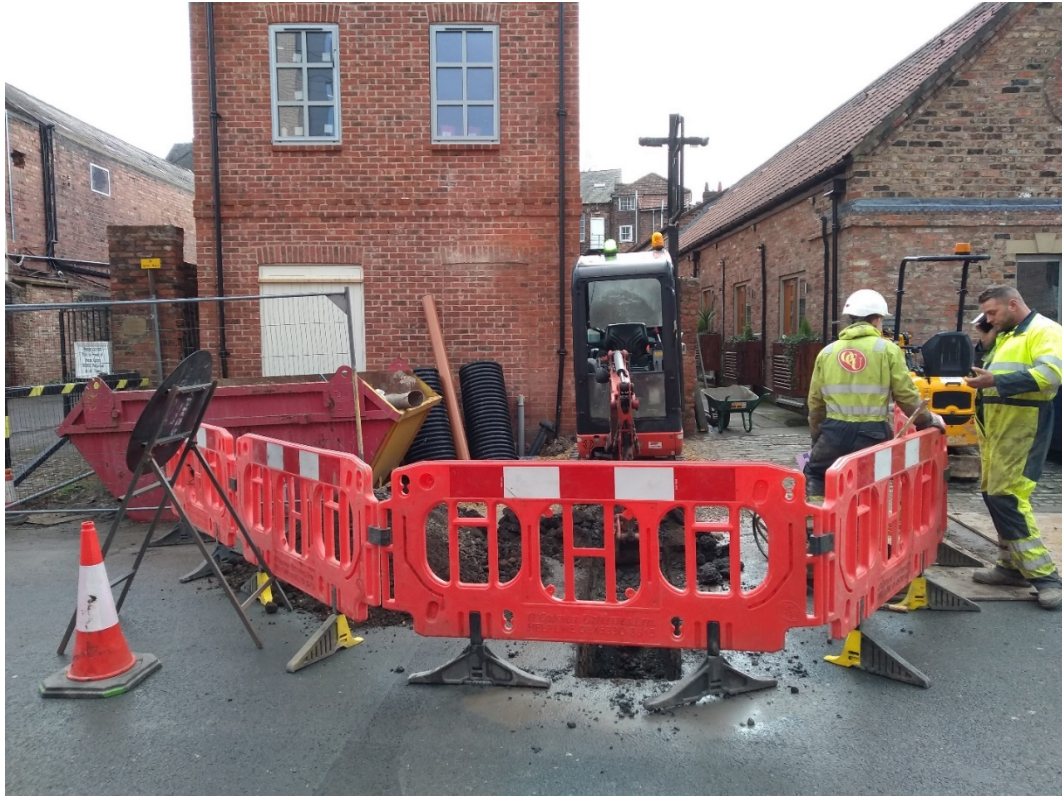
Plate 1 General view of monitored works, facing south-east.