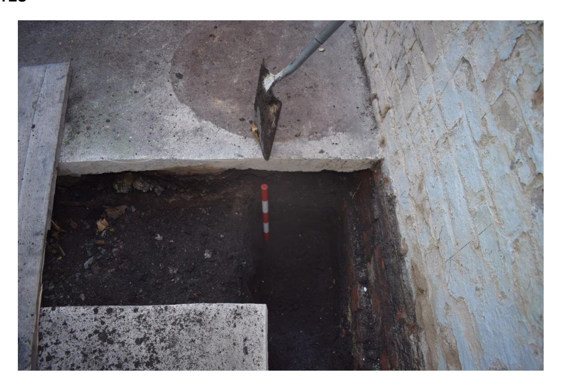
Plate 1. South-east facing view of trial hole and possible garden soil (0.50m scale).