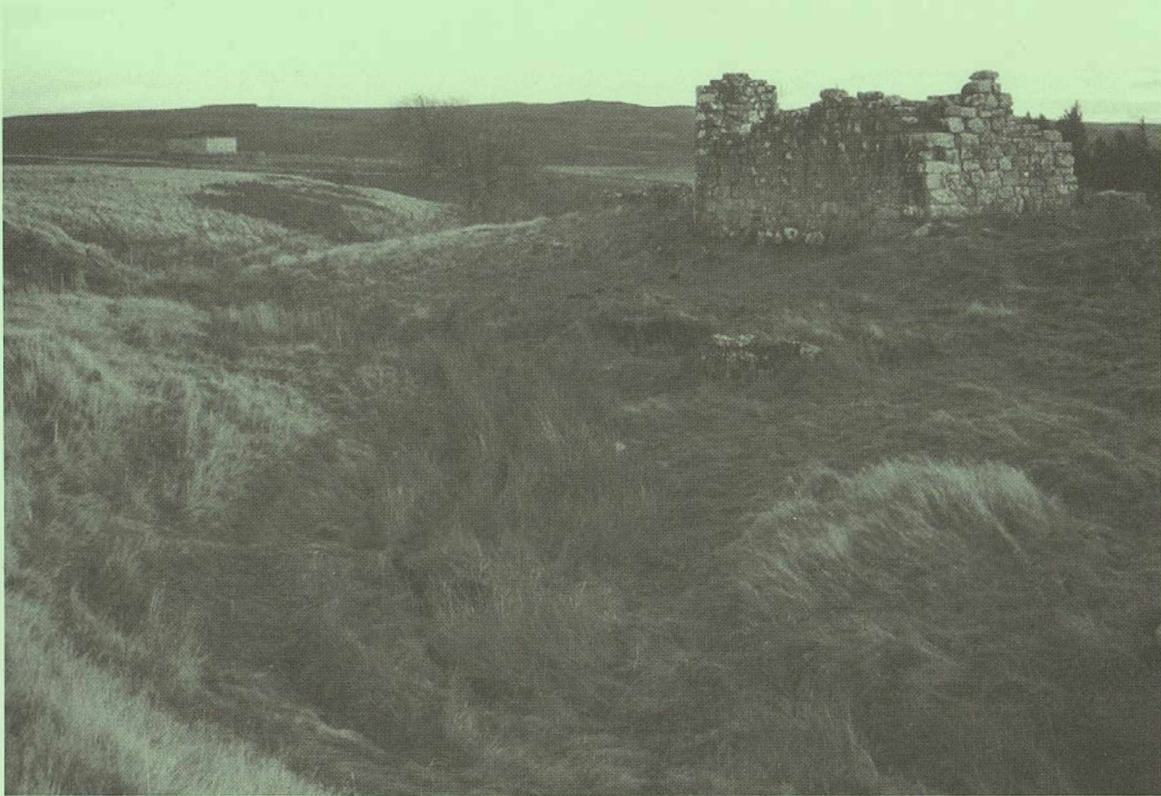
Ironhouse Bastle

The Journal of the Northumberland Archaeological Group