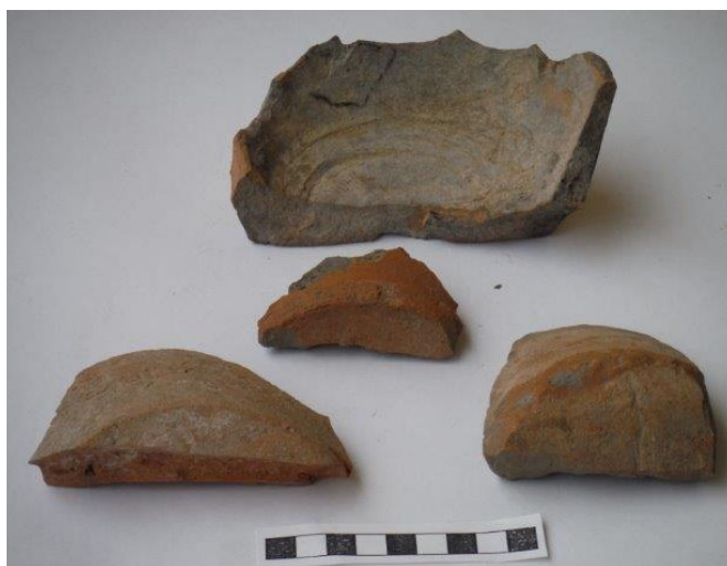
Photo 5. Fragments of pottery.