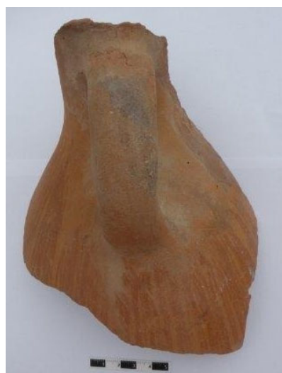
Photo 4. Pitcher fragment Inv9.