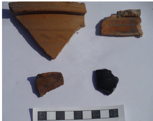
Photo 2. Ceramic patterns Inv2 rim and Inv14 Obsidian.