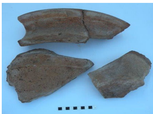
Photo 3. Fragments of pure clay pottery.