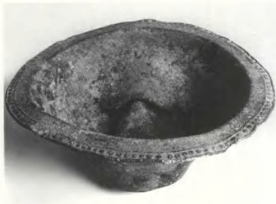
Plate 1 Late Roman pewter vessel from Sandy