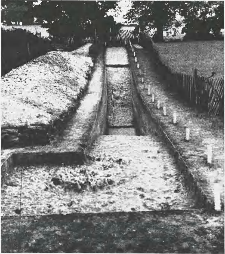
WAULUP'S BANK Section I, looking towards the interior of the camp.