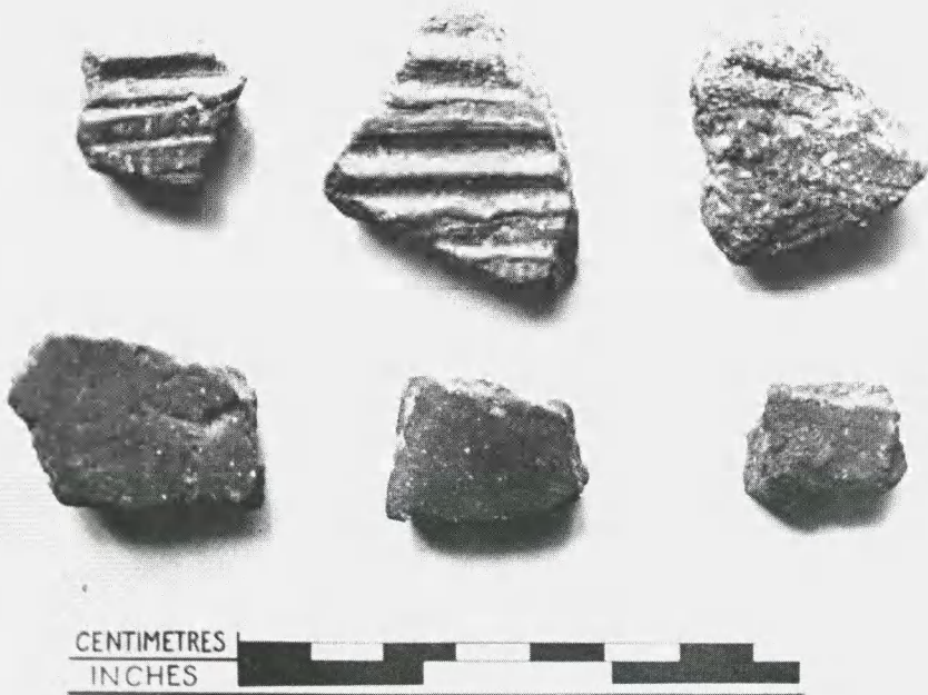
(b) WAULUD'S BANK, Rinyo-Clacton and Indeterminate Neolithic sherds.