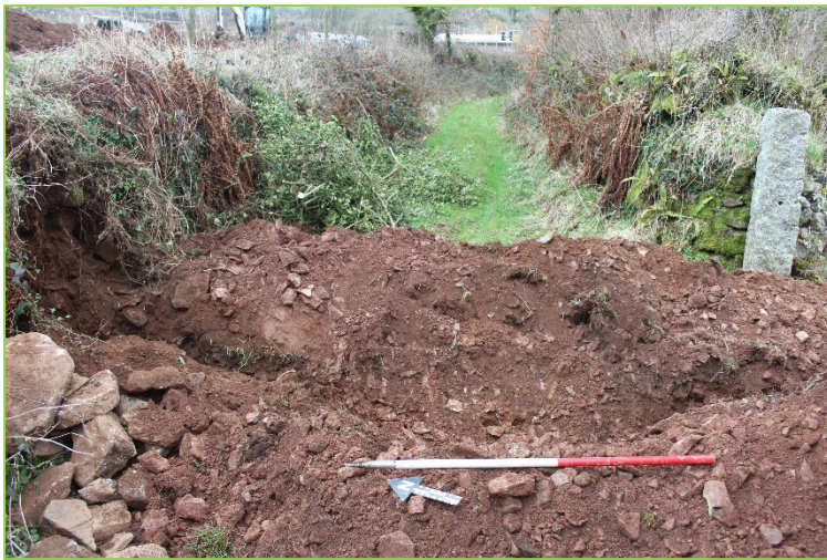
Plate 2: Cable trench cutting through the sunken lane, with stone-faced bank to the left. Scale at 1m. View to the east.