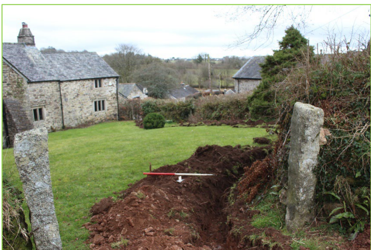
Plate 3: General view of the garden area directly to the north of Welltown Farm. Scale at 1. View to the south-west,