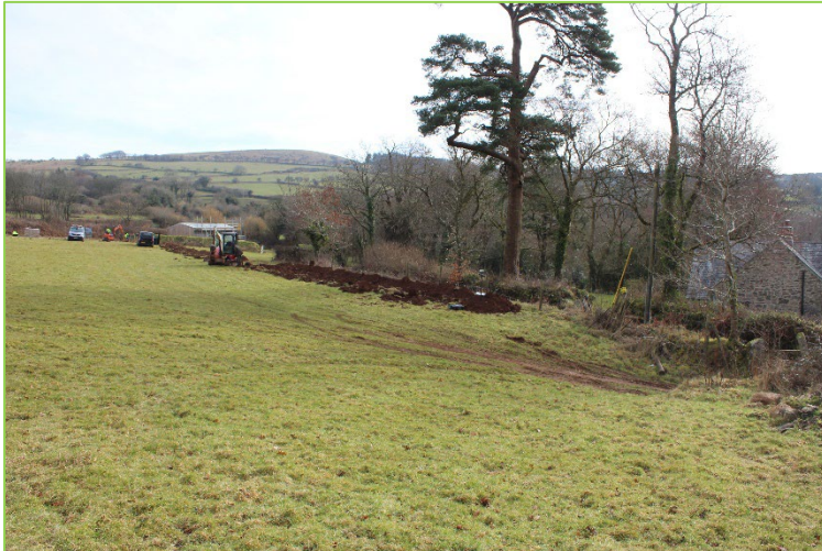
Plate 1: General view of the northern extent of the cable trench, showing the southerly sloping field, the sunken lane, and Welltown Farm building to the right. View to the south-east.