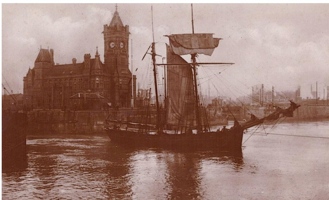
2 Masted Schooner