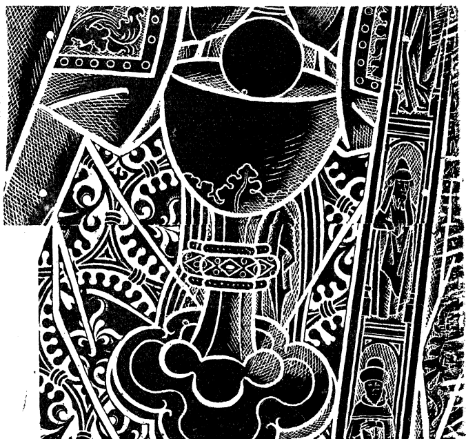
REVERSE OF INSCRIPTION TO NICHOLAS WEST.

figure, as some drapery appears on the right-hand side of the stem of the chalice. Above the chalice can be seen a portion of the hands, which were joined in prayer, and the wide sleeves of the albe with broad apparels ornamented with foliage work. Over the left