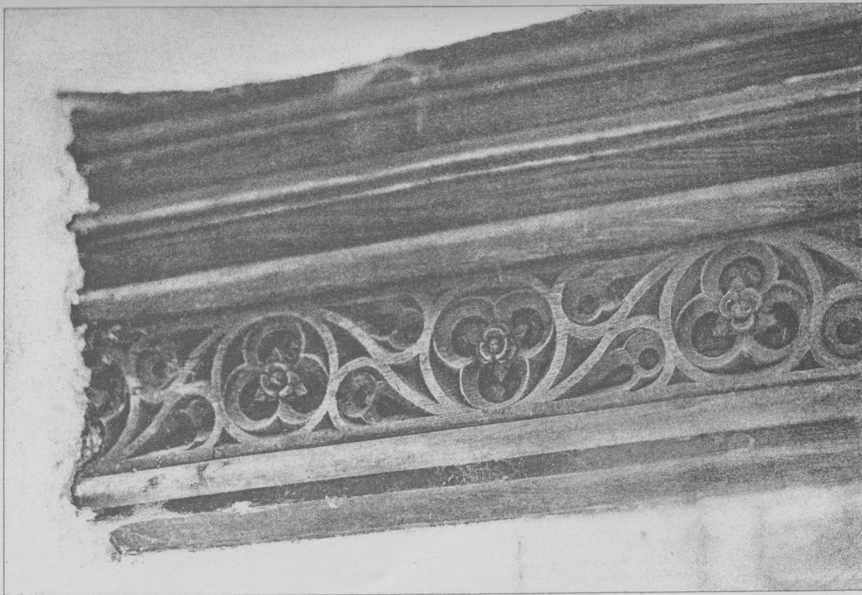
(2) DETAIL OF CARVING APPLIED TO WALL-PLATE; SOUTH WALL OF CHAMBER.