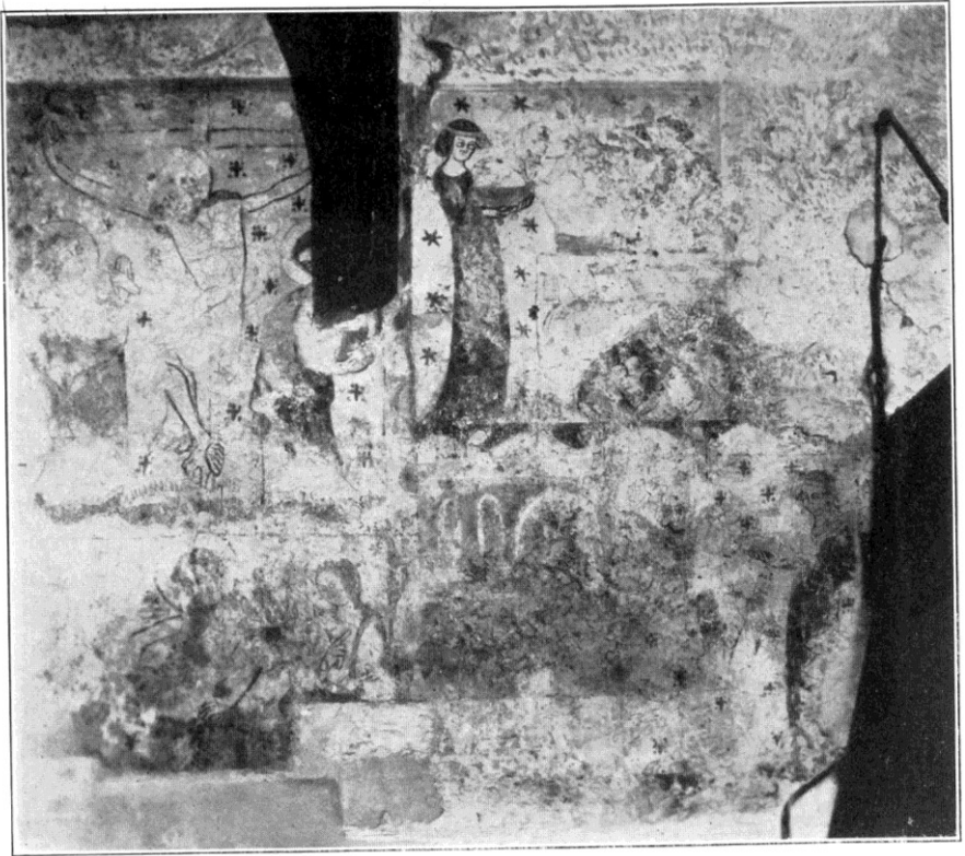
CHALFONT ST. GILES. PLATE III.