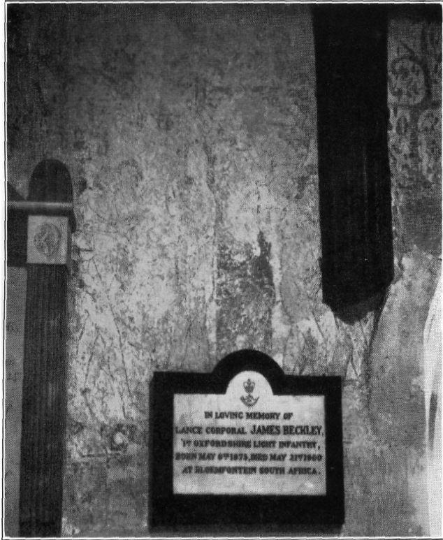
CHALFONT ST. GILES. PLATE II.