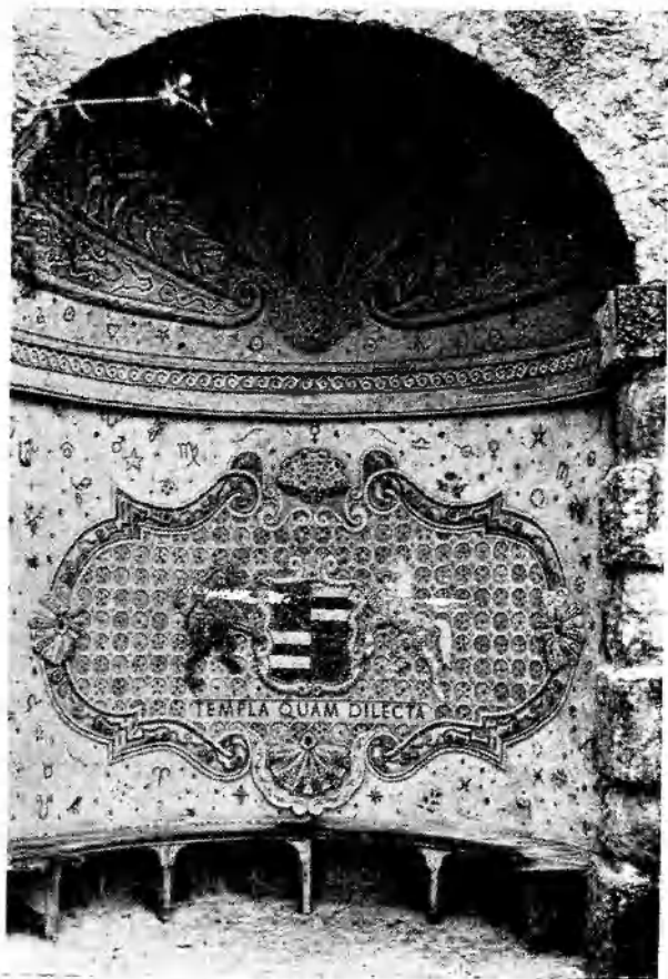
PLATE XIIIb. STOWE. Pebble Alcove after restoration.