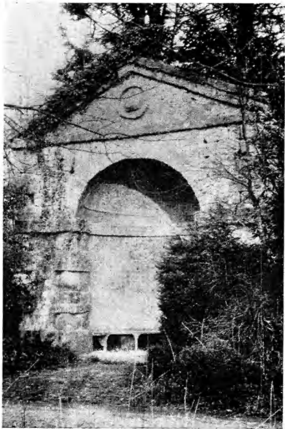
PLATE XIIIa. STOWE. Pebble Alcove before restoration.