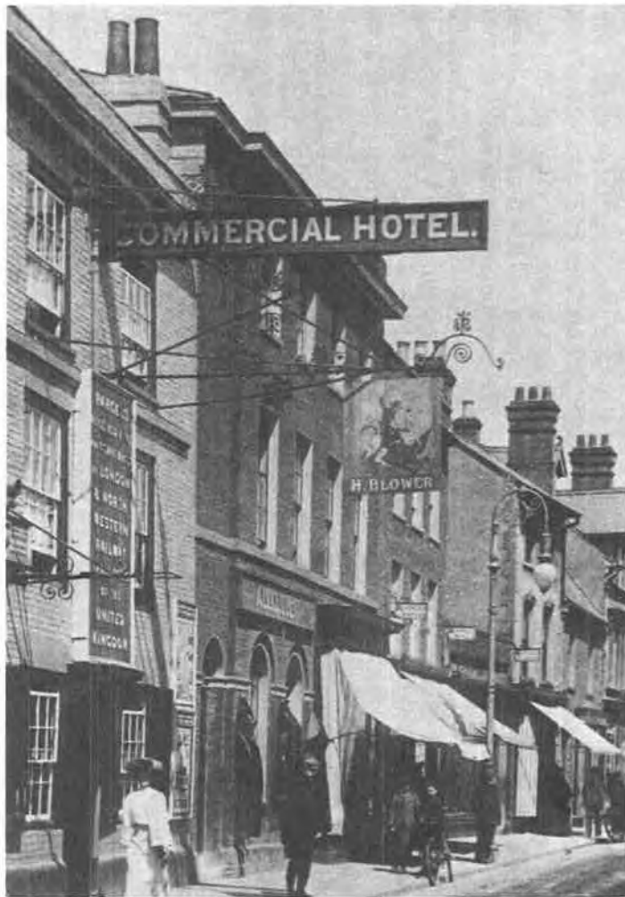
PLATE 1. 16 High Street, Chesham before recent alterations.