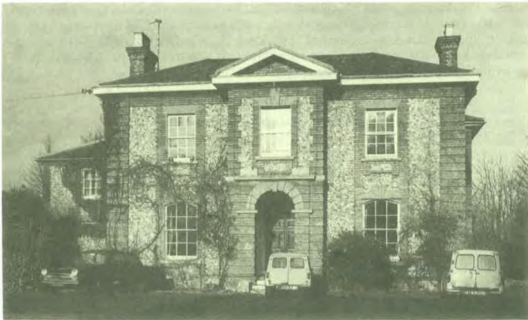
PLATE 4. Weston Turville Rectory.