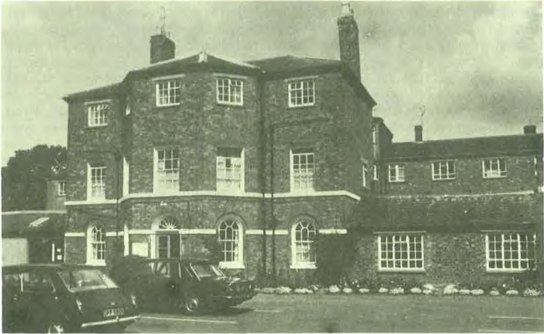
PLATE 3. Winslow Hospital, formerly the Workhouse.