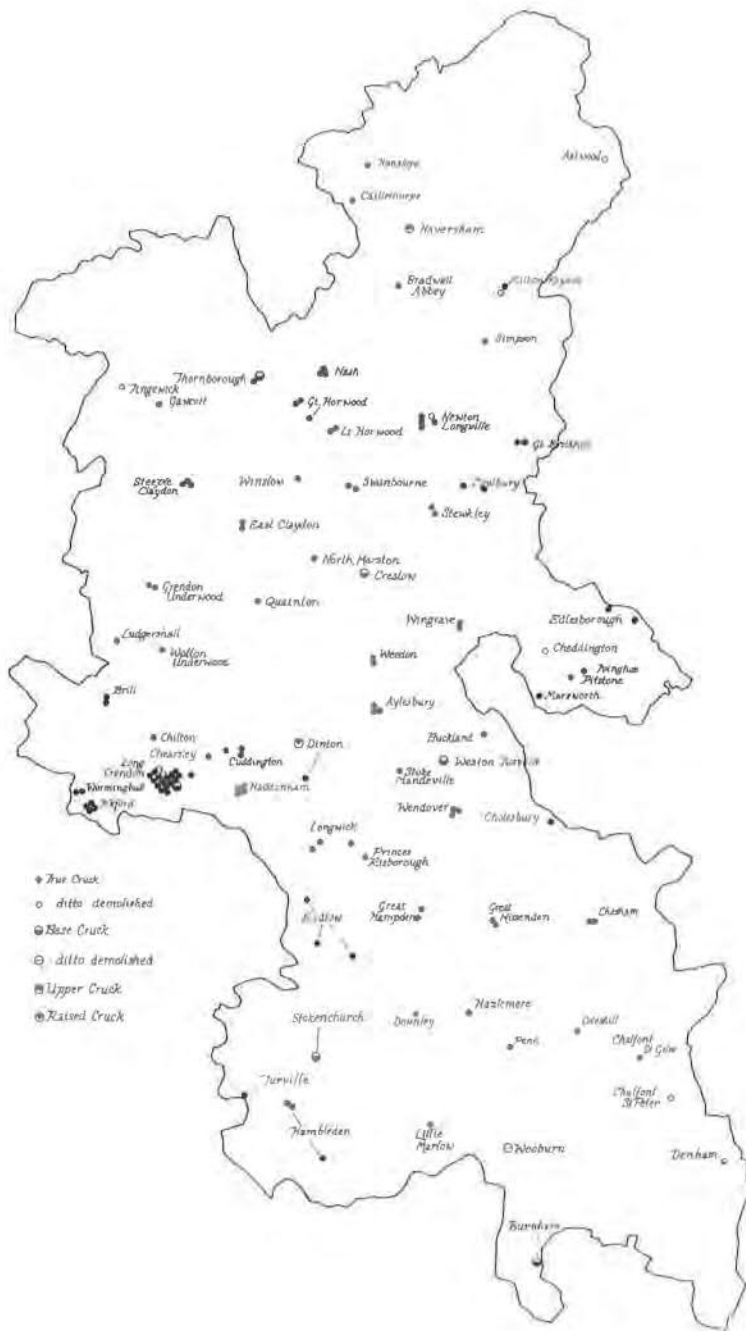
Fig. 2. Crucks in Buckinghamshire: location by civil parish.