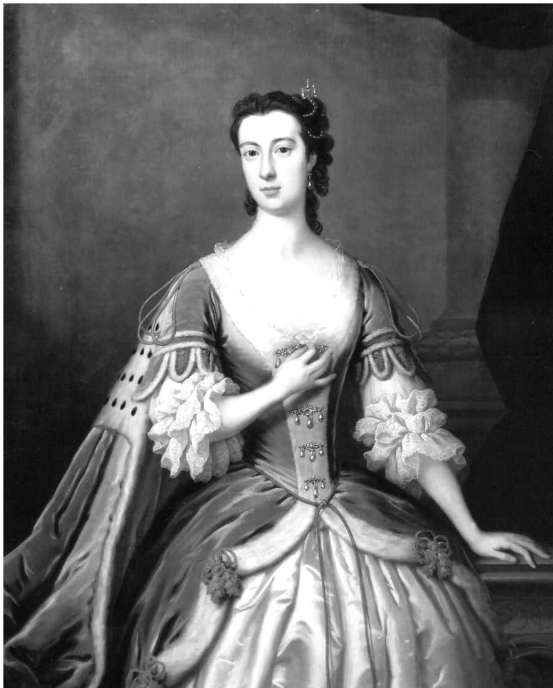
FIGURE 2 Portrait of Lady Lydia Davall, 2nd Duchess of Chandos, by Thomas Hudson.