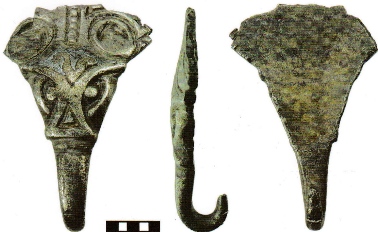
Medieval (9th-11th century) hooked tag or clothes fastener, silver: detector find from south Buckinghamshire (scale = 5mm)

THE JOURNAL OF THE BUCKINGHAMSHIRE ARCHAEOLOGICAL SOCIETY