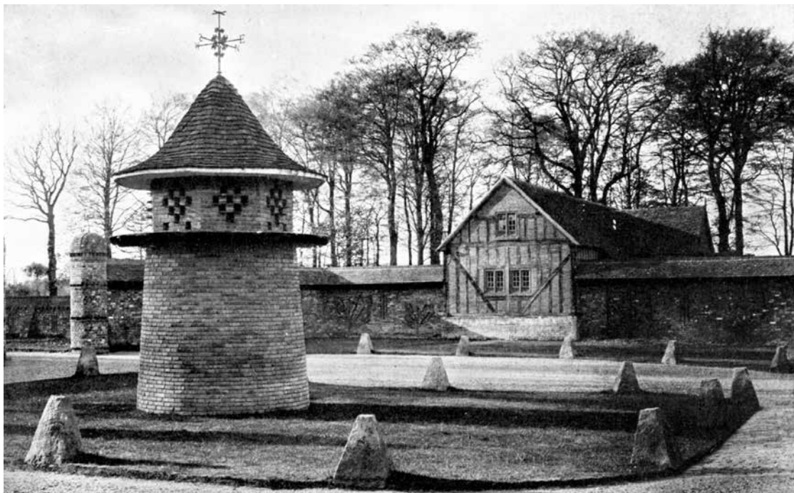
FIGURE 3 Pednor House, near Chesham, is an Arts and Crafts garden. The fine ensemble of buildings surround a forecourt across which the public lane runs. The dovecote is the focus of the forecourt (S Rutherford).

and remodelled in Arts and Crafts style c.1904–10 for J.W. Mann, a local boot and shoe manufacturer. Based on two long-established burgage plots united c.1904, it is focussed on an early thatched cottage as a cottage orné towards the centre of the garden design which divides the garden into two separate compartments. The relatively large and fine greenhouse designed and built by W.S. Revitt of Olney has been recently restored. It is set on a terrace in the smaller compartment near the house, and has a central projecting canted bay. The ensemble established by c.1910 survives well, including enclosing garden walls, motor house, an early electricity generating house (c.1904), mature trees and shrubs, and paths, along with an ornate iron Arts and Crafts front fence to make this a good example of a complex town-house garden.