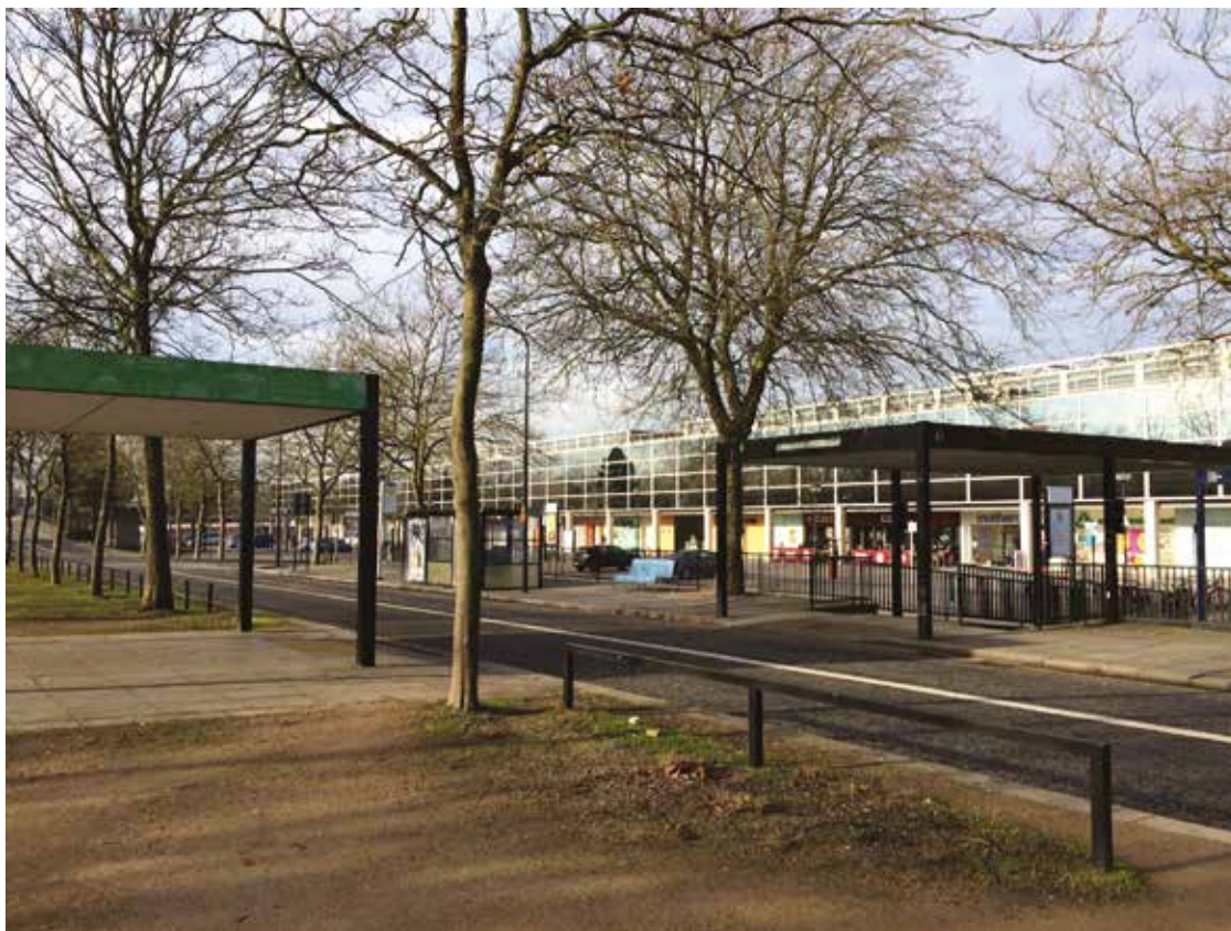
FIGURE 7 Central Milton Keynes lies at the heart of the city and was part of the celebrations in 2017 of 50 years since Milton Keynes was founded in 1967. It has largely grown to an established masterplan to become a world-renowned example of urban planning with many designed open spaces. The detailing of the landscape design, including these sheltering porte cochères leading visitors to the distinctive shopping building, is essential to the historic character.

A particularly fine, possibly the best, example of mid to late 20 th -century British town planning, designed as the focus of a new city, which survives intact. Milton Keynes is the most advanced and arguably successful of the British mid to late 20 th -century new towns and continues to be regarded as a model for planners as far afield as China. As its civic, public and business heart CMK is surrounded by satellite residential and industrial areas and linear parks, all linked by the innovative grid system of main roads. CMK occupies 250ha,