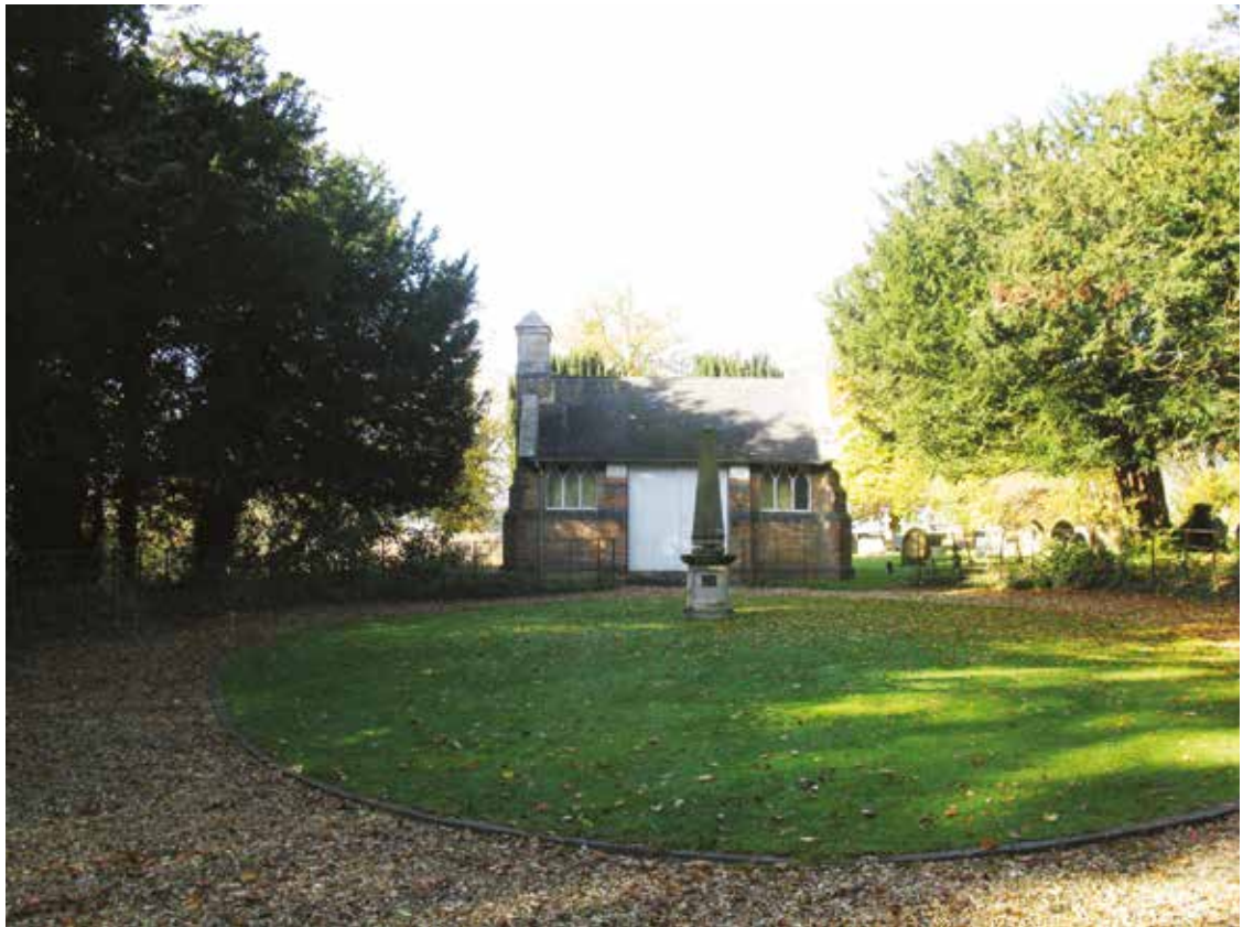
FIGURE 6 Dadford Parish Burial Ground was financed and opened in 1883 by the 3 rd Duke of Buckingham for the parish of Stowe. He paced out the boundaries of this example of 'God's Acre' himself, before it was designed by his steward with an unusual oval carriage sweep flanked by yews. It is a little-known but notable part of the former Stowe estate ( Ken Edwards ).

A late 19 th -century rural Anglican parish burial ground, well preserved, with strong links to the adjacent Stowe Park and its late 19 th and early 20 th -century owners. The 0.5ha. (1 acre) site is focussed on a central polychrome brick chapel by the clerk of works to the Stowe landowner, the 3 rd Duke of Buckingham. The layout was designed by the Duke's steward and was closely overseen by the Duke, who is said to have paced out this example of 'God's Acre'. Planting includes mature specimen trees typical of late 19 th -century ceme-