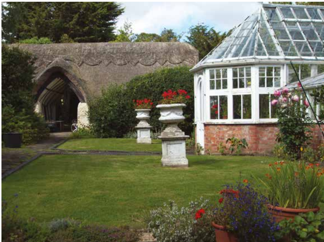
FIGURE 4 Orchard House, Olney. This fine market-town garden combines two burgage plots and was laid out in two phases: in the mid-19 th century and c.1904–10. It is dominated by the 17 th -century cottage, later remodelled as a cottage orné garden feature, and the large glasshouse designed and built by W.S. Revitt of Olney c.1904–10 ( Ken Edwards ).

immediate agricultural and river setting is of high significance. The river Colne and views across it over farmland were formerly prominent to the east, north and south, with an associated drive/road, but the river is now screened by vegetation and the area beyond is a lake.