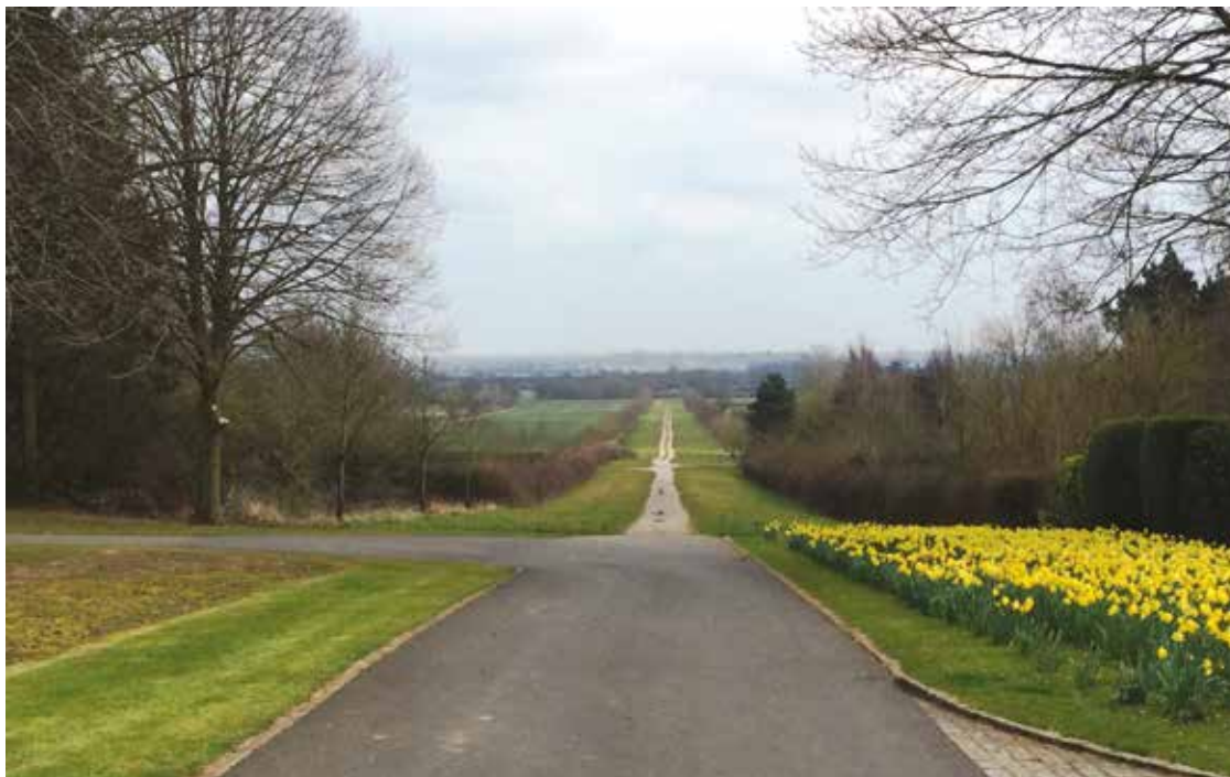
FIGURE 2 Hillesden House. The spectacular east avenue was established probably in the 17 th century. The formal layout for the country house was developed from the 1490s to the early 18 th century and, since the house was demolished in the 1820s, survives in relict form, including major earthworks, trees, drives and walls, adjacent to the parish church known as the ‘Cathedral in the Fields’ ( Adrian Jackson ).