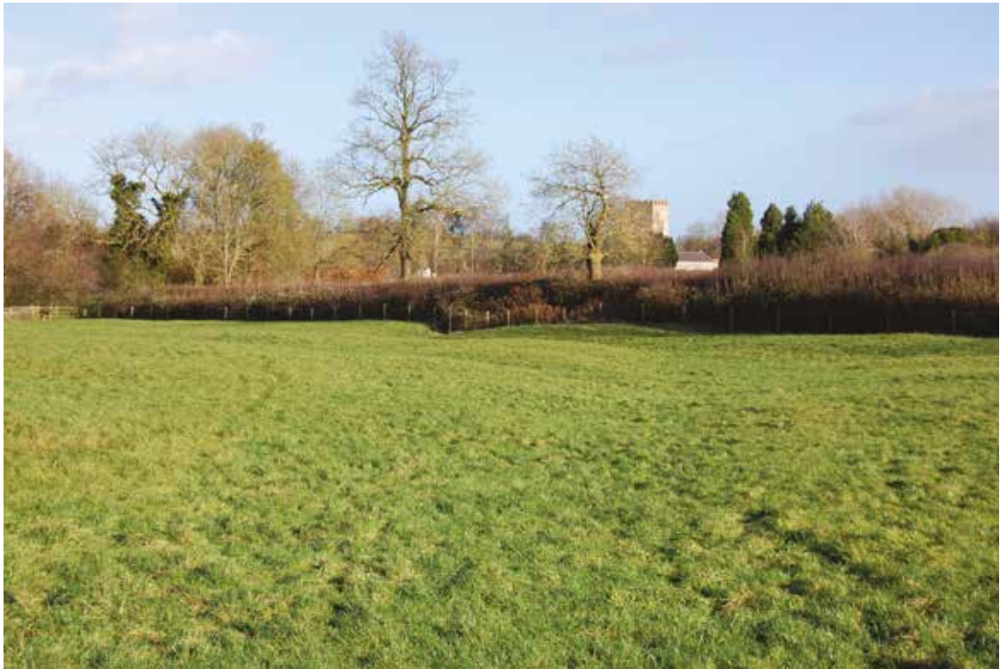
FIGURE 5 Third field boundary balks at Oxeners

Christmas Hill is to the west of the road junction on the south side of the Buckingham-Bletchley road. Luffield Charters describe Cristmerehull , 582, dated 1243–50, Cristemereshull , 586, dated 1240–51, Cristemerehull , 595, dated 1240–51, Cristmarehul 703, dated 2 March 1298, Crystemerehull , 711p, dated 1313–31 and Cristenhull , 711j, dated 25 March 1290. It means in Old English ‘the hill with Christ’s mark’, in other terms the hill with a cross raised upon it. Luffield Charter 711p places Cristemereshull in Mylnefeld, the third