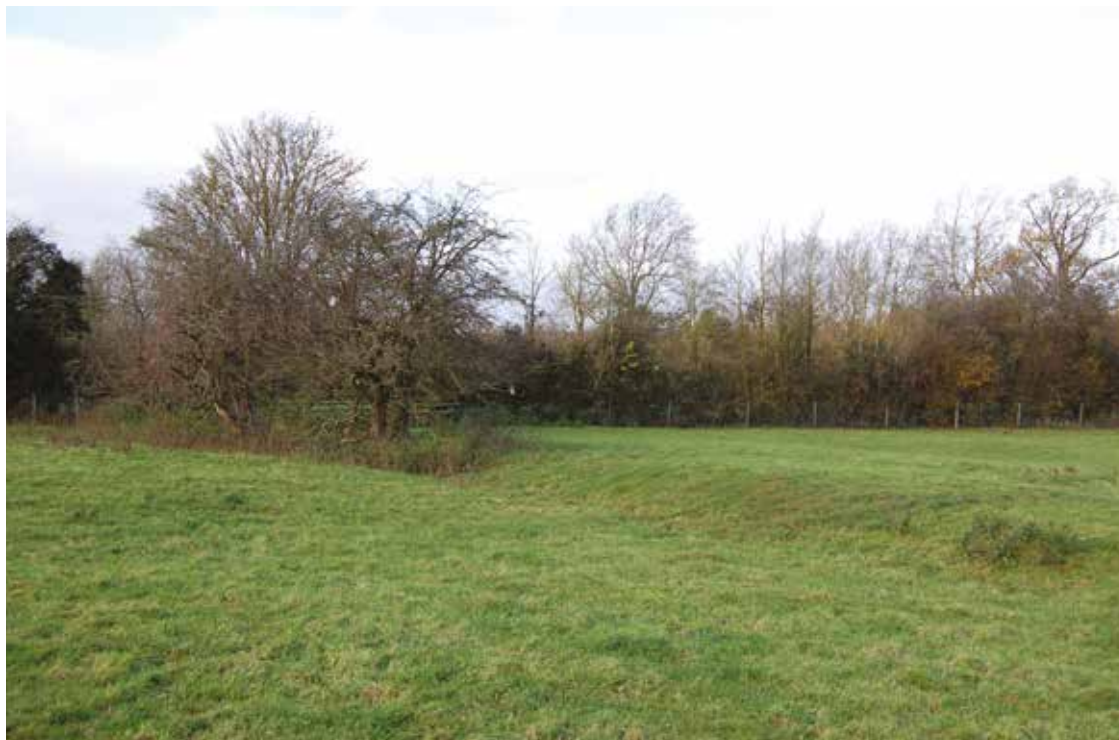
FIGURE 3 Boundary and embankment behind 'Fraynesplace'

Portwey to the south of the habitations that run along modern Lower End. This ditch wends its way along the southern boundary of Stoneylands Farm behind both Lower End Farm and College Farm whose grounds extend further south than the other properties, suggesting that a bend in the ditch was exploited to maximise space for each farmyard.