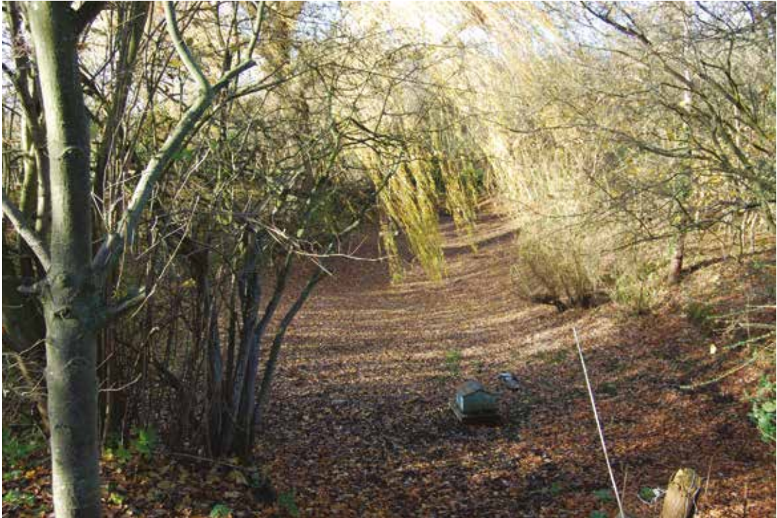
FIGURE 2 The remains of Greenditch behind the manor

meaning a shingle or gravel pit. There are a lot of deposits of glacial aggregate in the immediate vicinity, as indicated by the name of the nearby hamlet of Singleborough in the neighbouring parish of Horwood. This aggregate was ideal for mixing with the abundant local clay to form a more easily worked soil. No doubt it was also used for local infrastructure purposes. This field name is firmly located in the South Field by Luffield Charter 656, dated 1240–46.