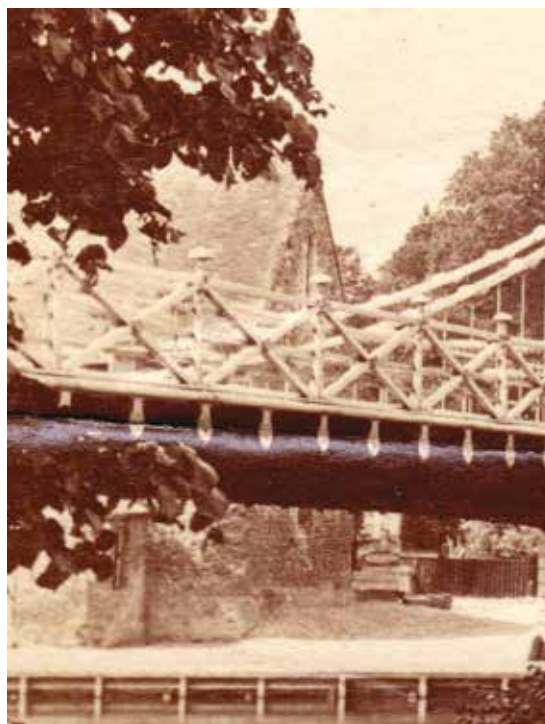
FIGURE 4 An enhanced Victorian photograph showing the close-laid flint construction of the hall

Altogether, the style of the hall suggests that it was built at about the same time as the tower of the medieval church of All Saints, which stood beside it. The tower of Marlow church appears to