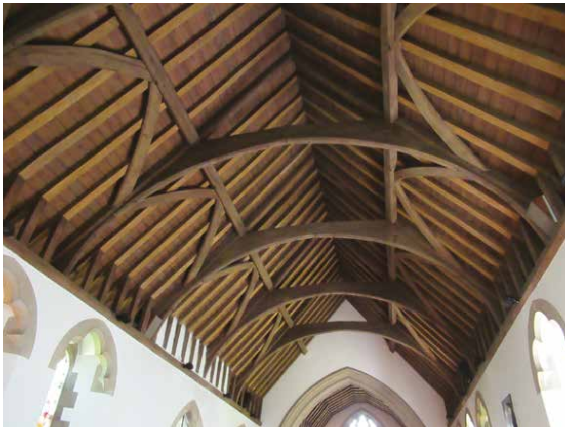
FIGURE 7 View of the nave roof at Holy Trinity church. The arch brace trusses, purlins and wind braces are medieval, common rafters and boarding are Victorian.

escape the thought that John Oldred Scott, having seen the roof in Marlow, designed the nave at Lane End specifically for it (Fig. 7).