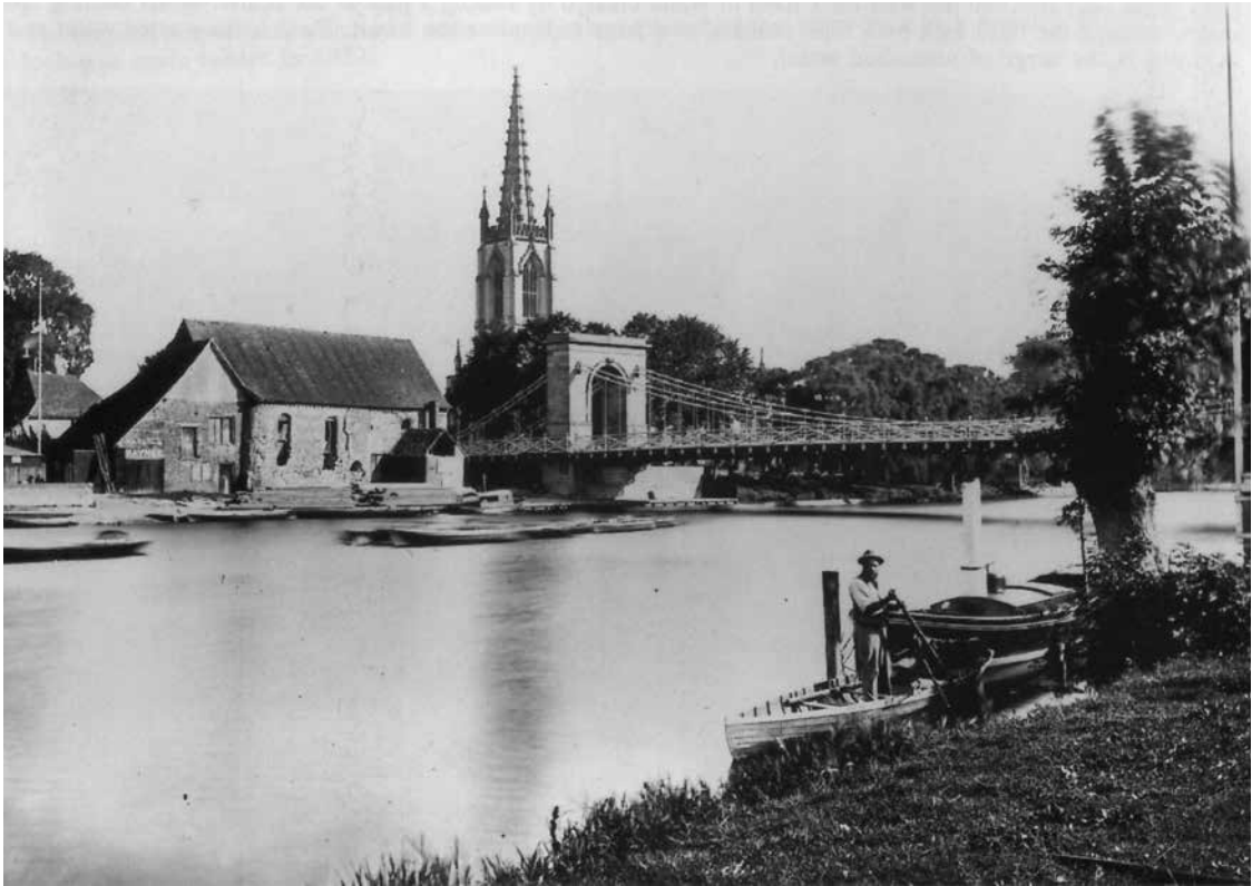
FIGURE 1 The hall on the wharf at Marlow

During the remaining thirteen years of his father's reign, Robert consolidated his position. He used his access to the stone quarries of Caen to construct at Bristol first the quays which became the foundation of the port's prosperity, then a castle which proved completely impregnable. In this building he set up his court. When, on Henry I's death, Stephen of Blois seized the throne, Robert kept a watching brief for two years. He was evidently reluctant to commit himself to resistance, but when Stephen's excesses and broken promises became obvious, he raised the standard of his half-sister Matilda in revolt, beginning the civil war known as the Anarchy. The cohesion of the Norman aristocracy, fragile at the best of times, crumbled and England was split down the middle, the eastern half of the country giving allegiance to Stephen in London, the west to the Empress and Robert in Bristol.