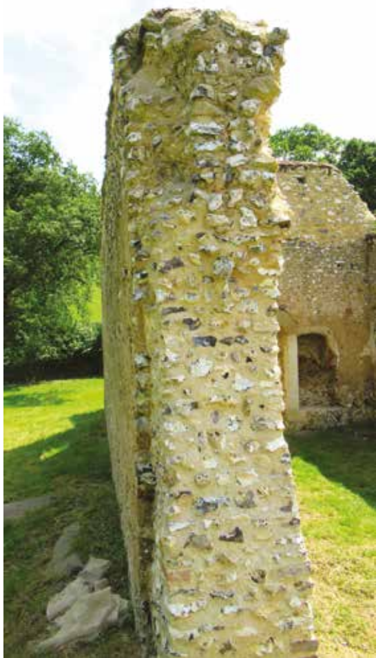
FIGURE 3 The collapsed wall at St James, Bix Brand, showing solid flint construction

method of travel at the time. There may have been an internal stair by this date, but there was also possibly an external staircase on the landward side, of which no illustrations exist. Medieval halls, because of the danger of fire, almost always had detached kitchens, which needed an external stair for serving food quickly. In this case a house immediately behind the hall, which existed before 1600, is a possible site of the kitchen.