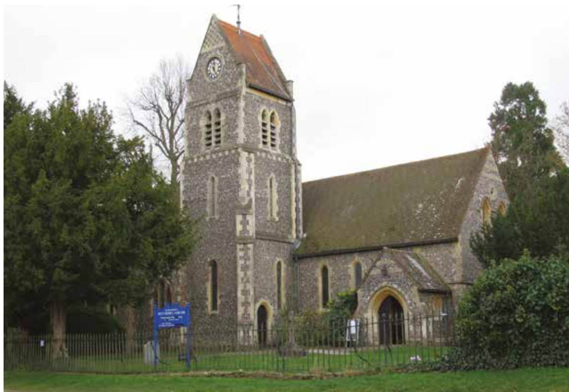
FIGURE 6 Holy Trinity church, Lane End, built 1878