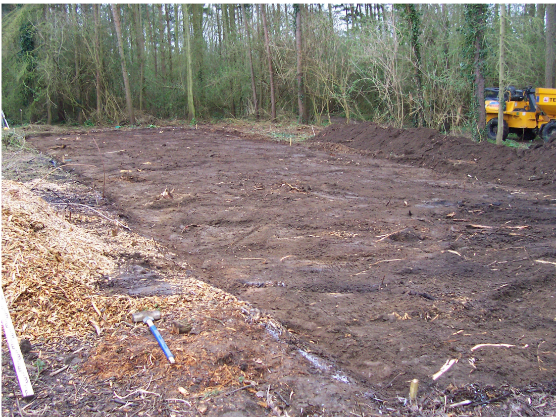
Skate park area after machining