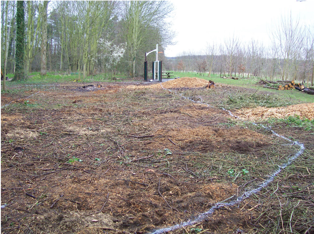
Skate park area before machining