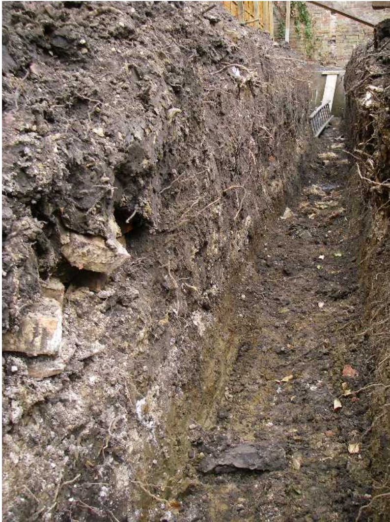
Figure 2: Wall foundation trench looking north