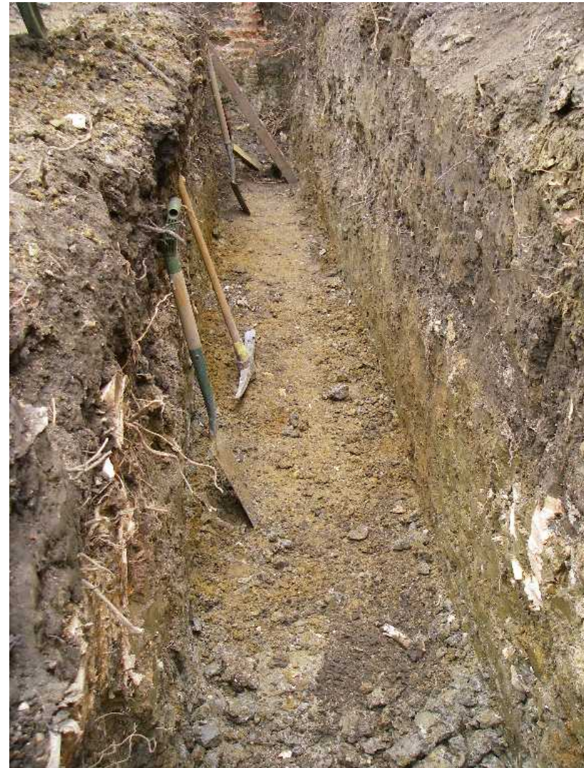
Figure 3: Wall foundation trench looking south