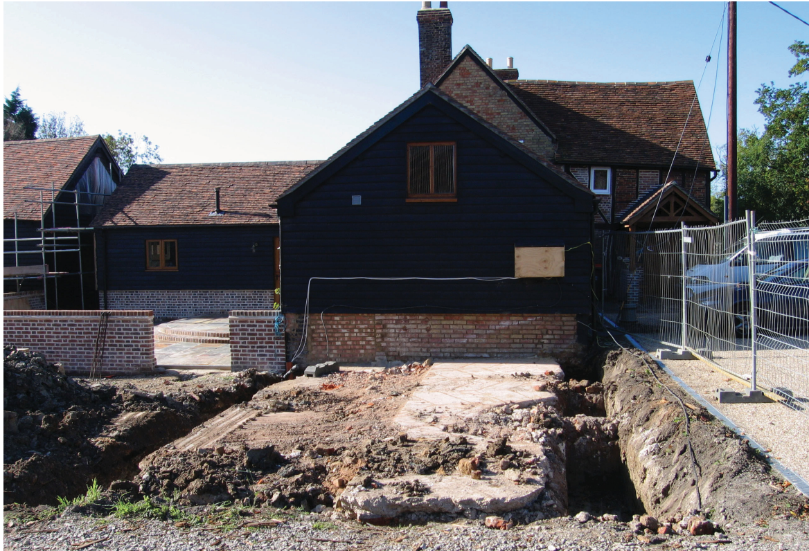
Photograph 1: Extent of the garage footings