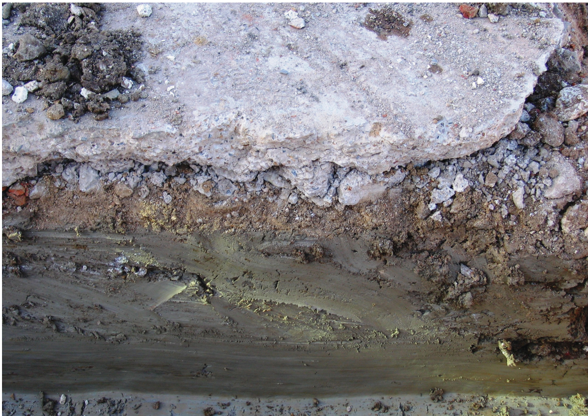
Photograph 1: Evidence of the disturbance caused by construction of the previous barn