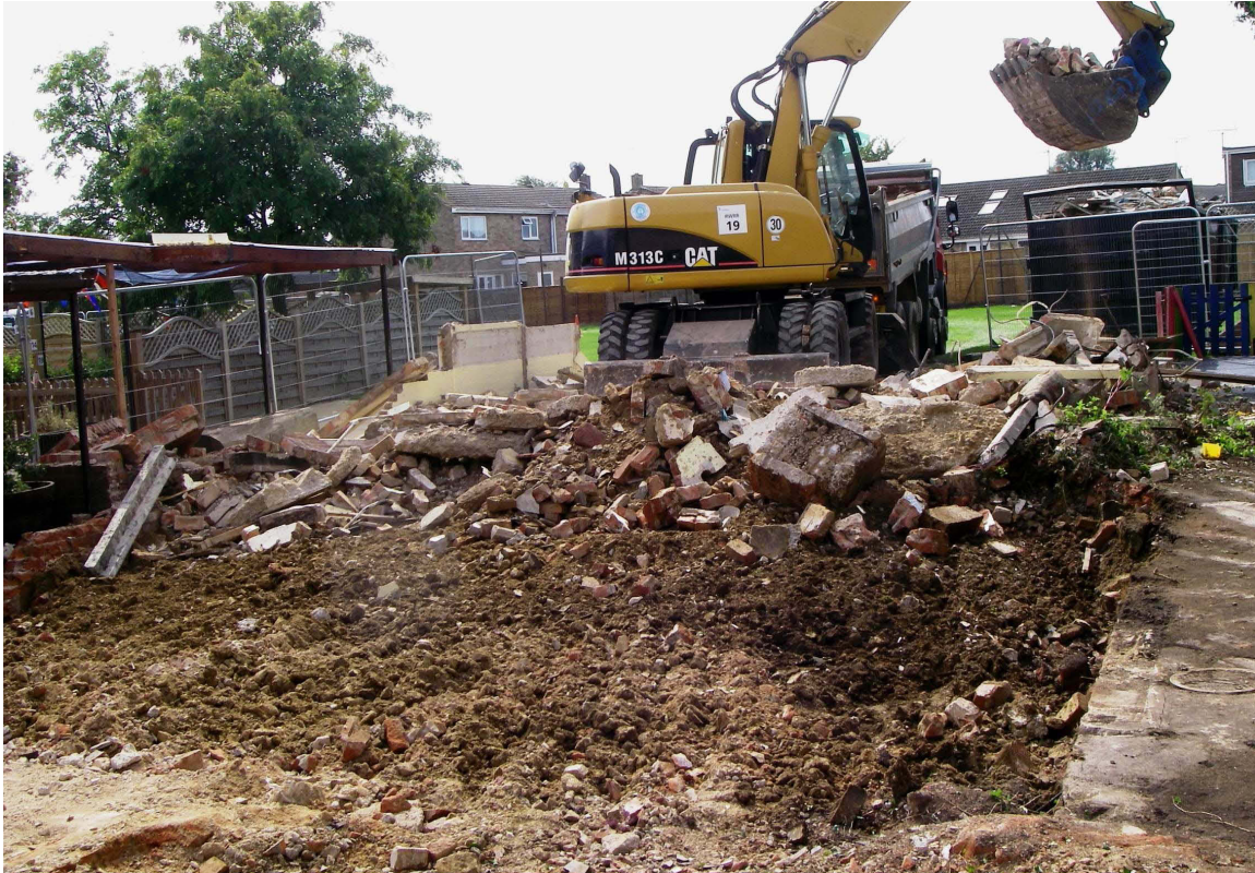
Photograph 1: removal of the concrete slab