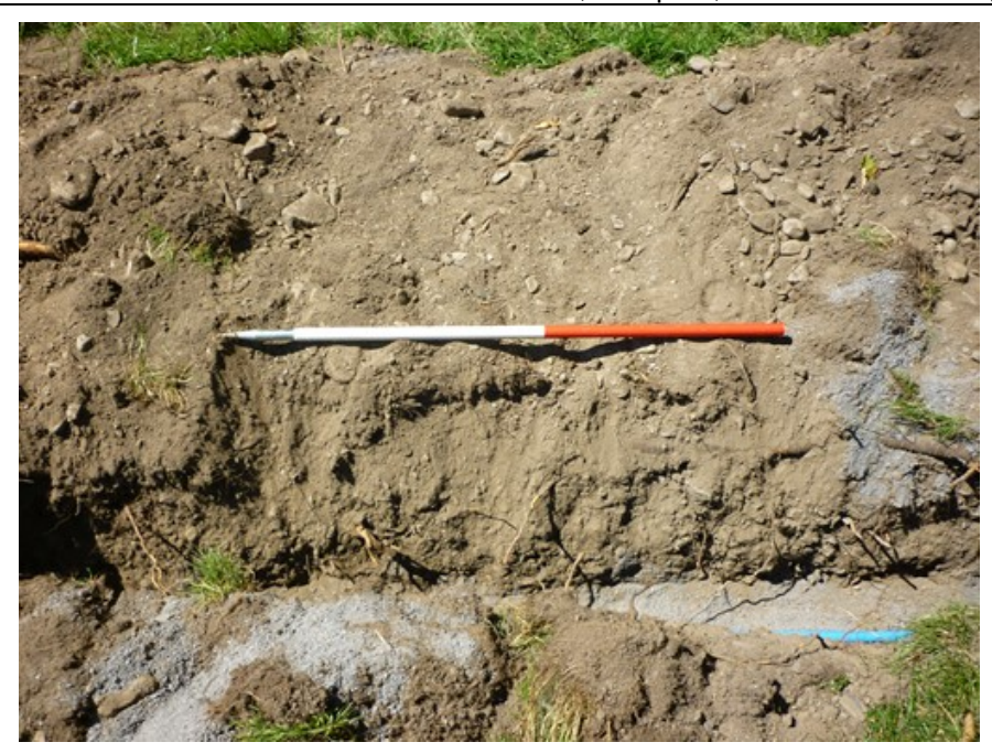
Plate 6 (left): Typical west-facing section