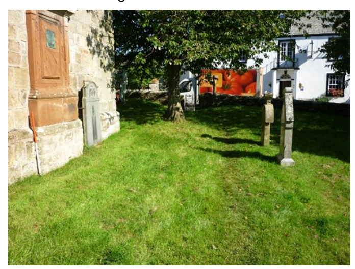
Plate 1 (left): Pre-excavation view at the east end of the church, looking north south

2.1.1 The watching brief monitored the excavation of a single trench running from the south side of the east end of the church to the north side of the churchyard (Plate 1). The excavation, totalling an area of approximately 15m<sup>2</sup> (Figure 1), was carried out using a small tracked mechanical excavator and the spoil was placed in a dumper bucket before being removed from site.