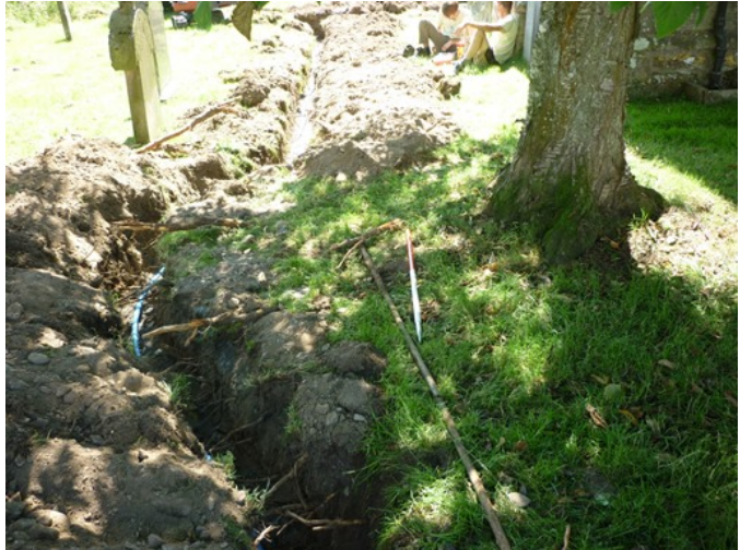
Plate 4 (left): Excavated area by perimeter wall to the north of the church, looking north Plate 5 (right) Diverted route around the cherry tree, looking south