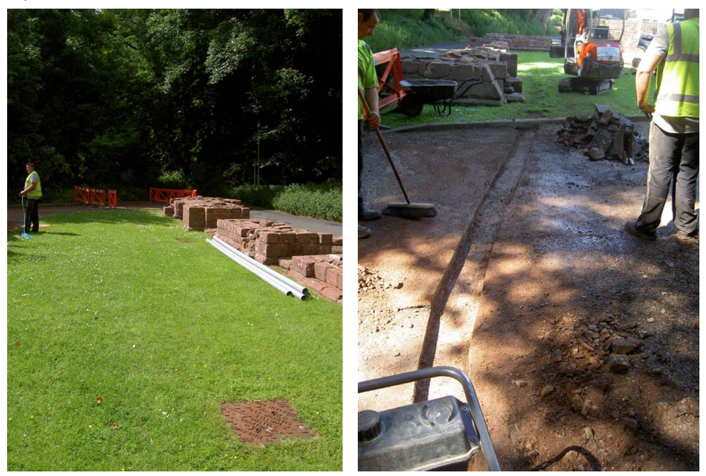
Plate 3 (left): Site prior to excavation, viewed from the north Plate 4 (right): Site following excavation, viewed from the south

4.1.1 Introduction : a single north/south trench was excavated, which was 20m long, 0.40m wide and 0.40m deep. The excavation of the trench was monitored by an archaeologist throughout. Colour print and digital photographs were taken at the location before the machine and hand excavation of the trench, as well as after the excavation and ground reinstatement had been completed (see Plate 3 and Plate 4). A plan of the trench was made with reference to the Abbey Gatehouse, which is shown on the site plan (see Figure 1), and sketch sections were produced on the context sheets that recorded the deposits encountered.