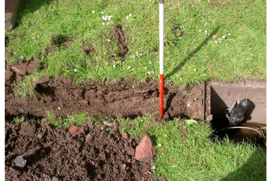
Plate 7 (left): North end of the trench Plate 8 (right): East facing section at the north end of the trench, showing backfill (101)