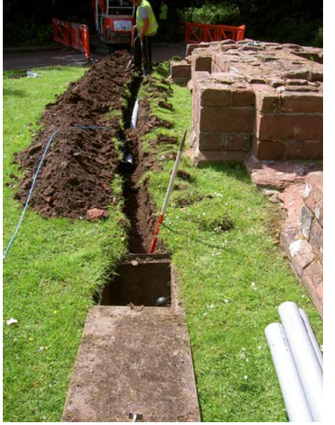
Plate 6 (right): East facing section of the trench at the junction of (103)/(104)