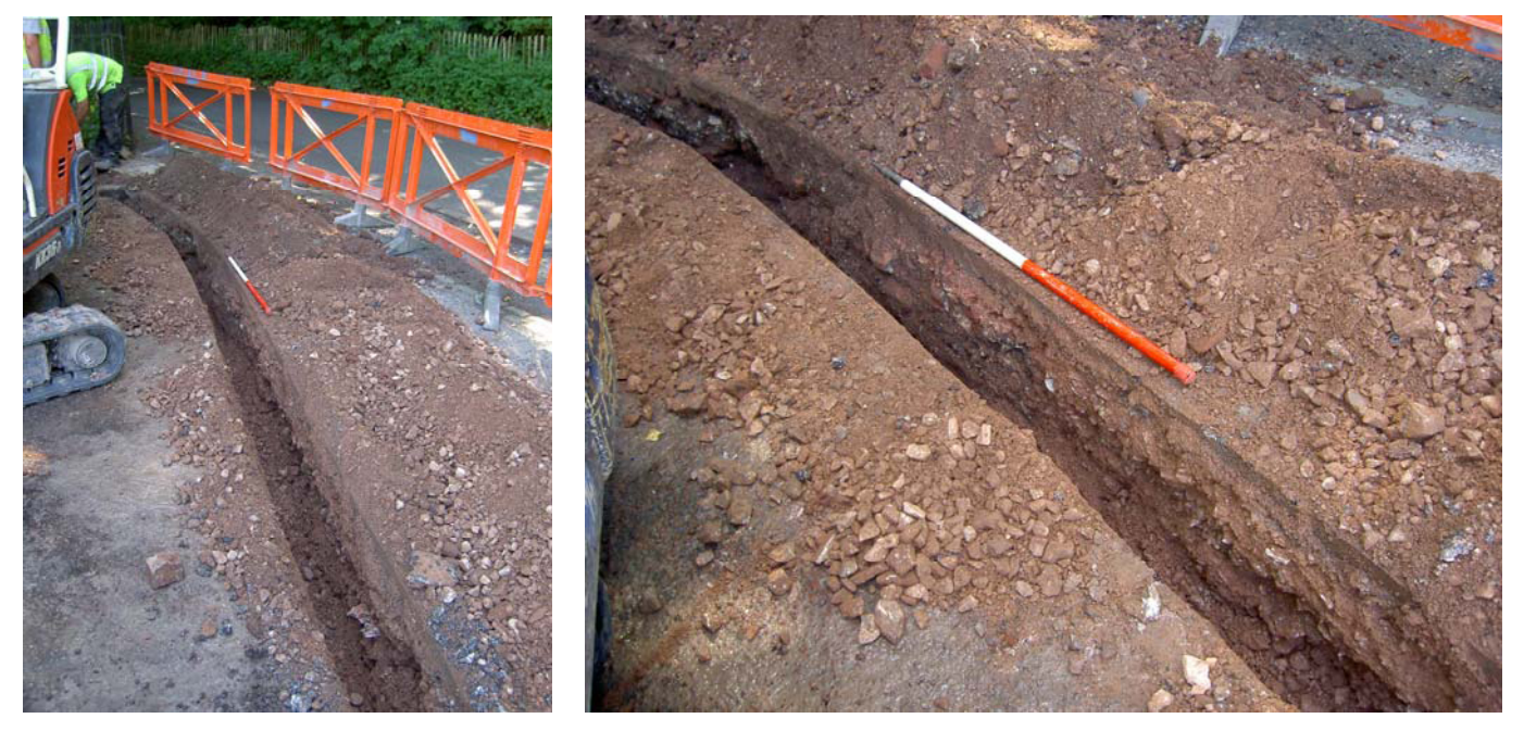
Plate 5 (left): South end of the trench

sandstone and mortar fragments (see Plate 7 and Plate 8), mixed with modern glass and ring-pulls from drinks cans. The deposit was located below a 0.10m thick layer of topsoil and was interpreted as disturbed subsoil with some re-worked demolition debris.