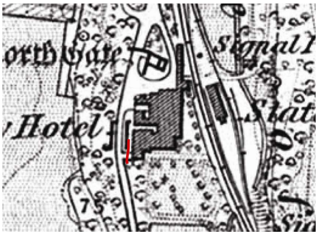
Plate 1: Ordnance Survey map, 1851, showing the approximate location of the watching brief area

3.2.3 Ordnance Survey 1891 (Plate 2): this map shows that very little has change in the immediate area of the site since the OS map of 1851.